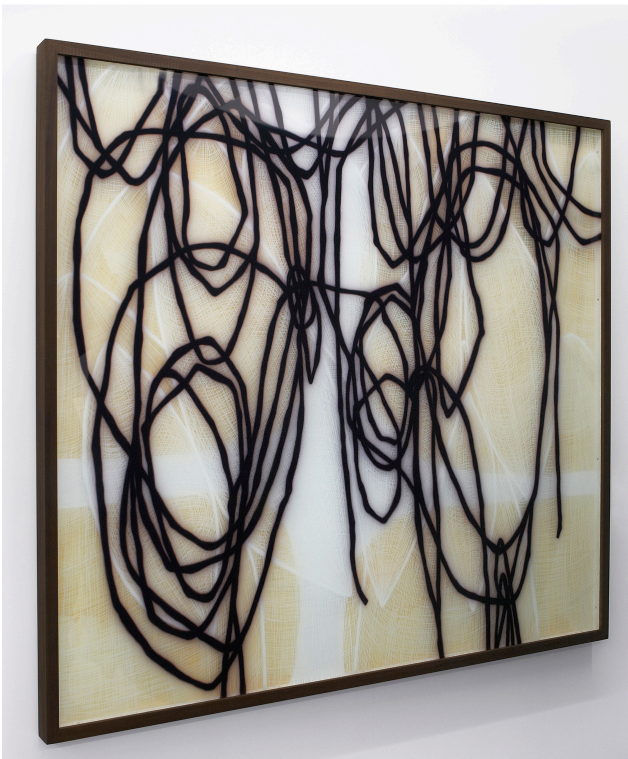
Julio Rondo PLUS DE LIAISON , 2008 Acrylic behind glass 154 x 180 x 6 cm Unique