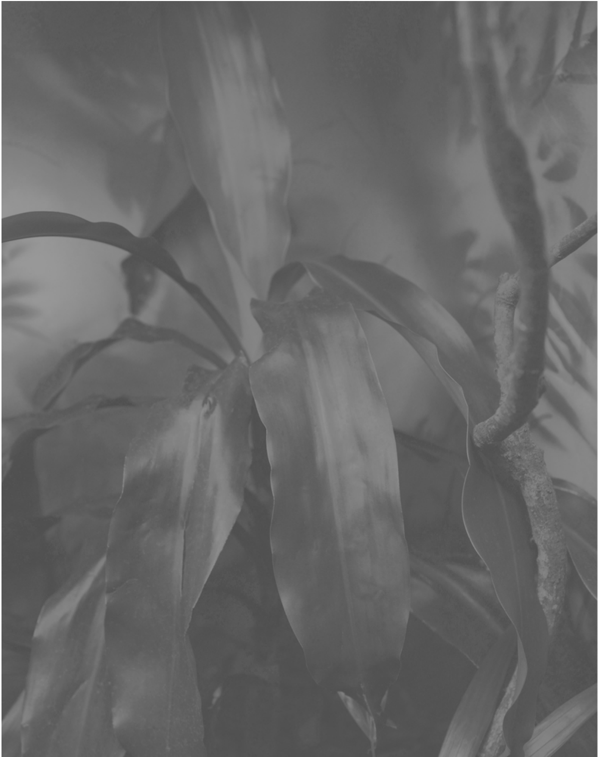
Caio Reisewitz planta cinza III (tudo que restou) , 2020 Chromogenic Print 70 x 55 cm | 71.1 x 56.1 cm (Frame) Edition : 5+2 AP