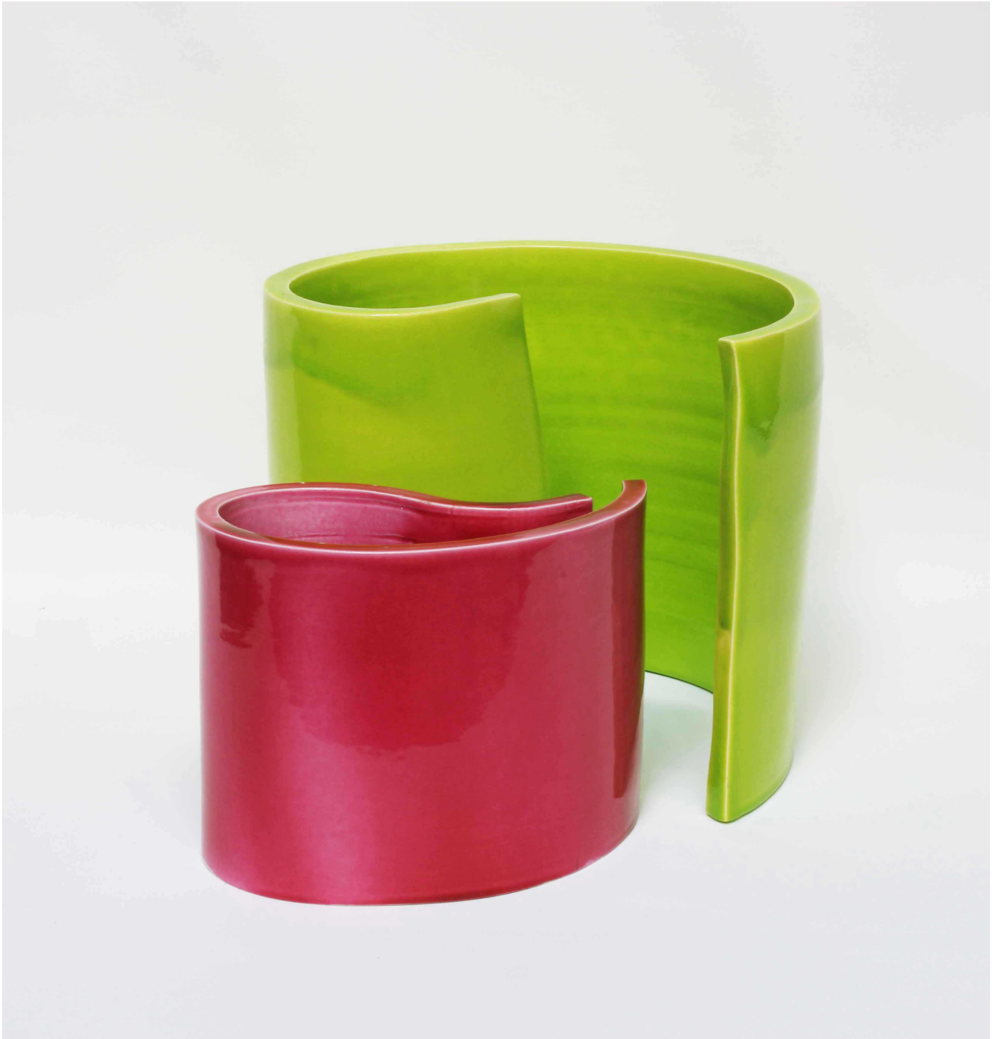
Alberto Cont Labirinto verde e rosa , 2006 Glazed stoneware 30 x 44 x 30 cm Unique