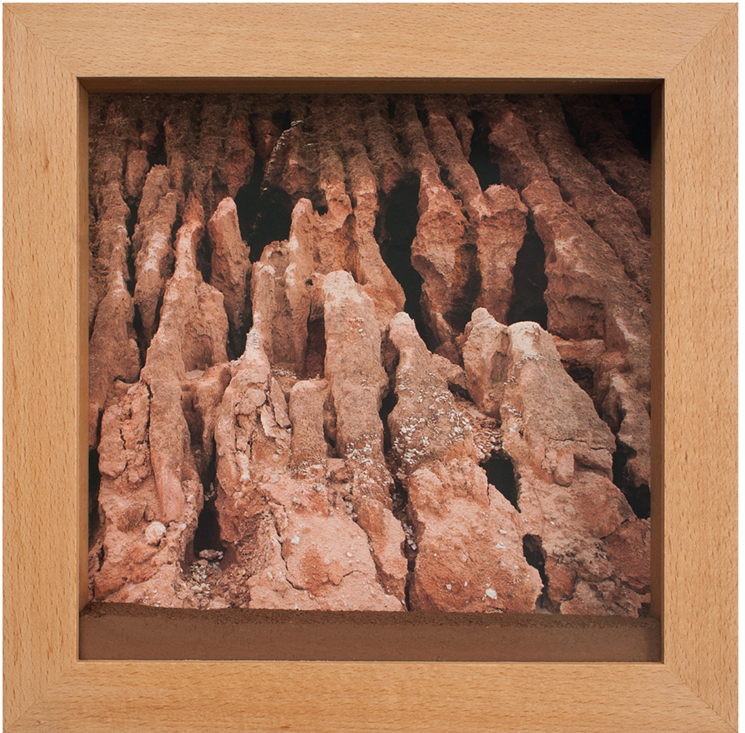
Pedro Motta Falência , 2018 Mineral print on cotton paper and mineral pigment 42 x 42 x 7 cm Edition : 5+2 AP