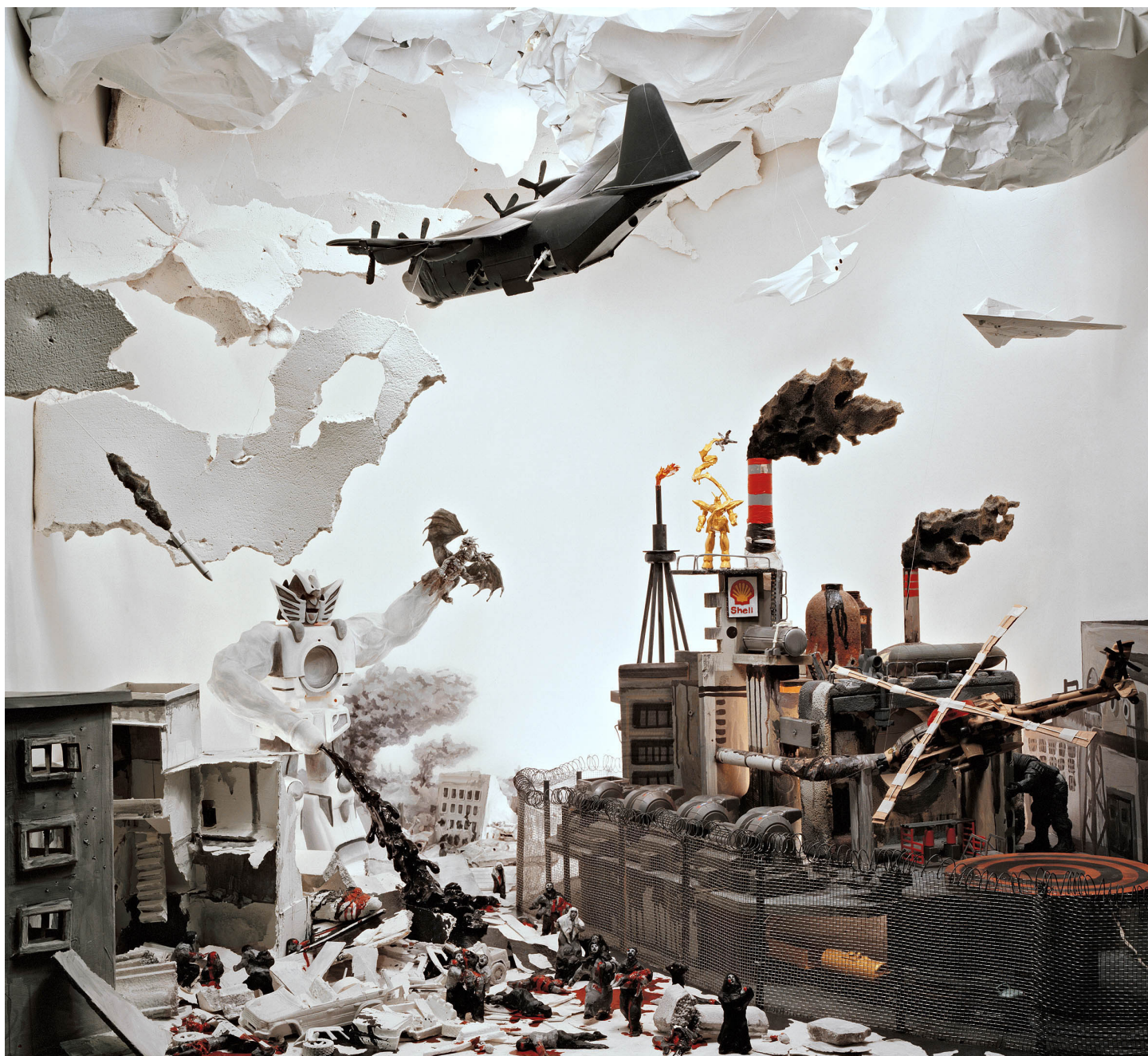
Norton Maza Architecture des ombres , 2009 Series : El delirio de los sabios Lambda Print 137 x 125 cm | 141.5 x 153.5 x 5 cm (Frame) Édition : 3