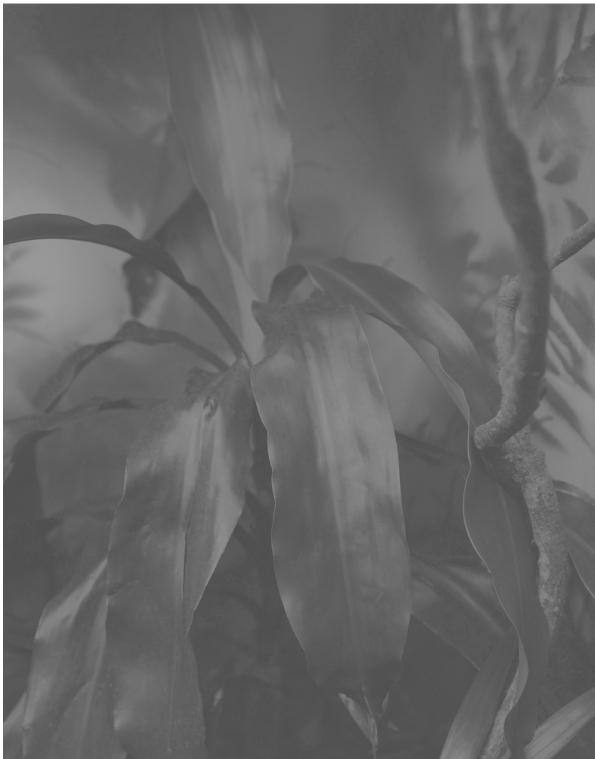
Caio Reisewitz planta cinza III (tudo que restou) , 2020 Chromogenic Print 70 x 55 cm | 71.1 x 56.1 cm (Frame) Edition : 5+2 AP