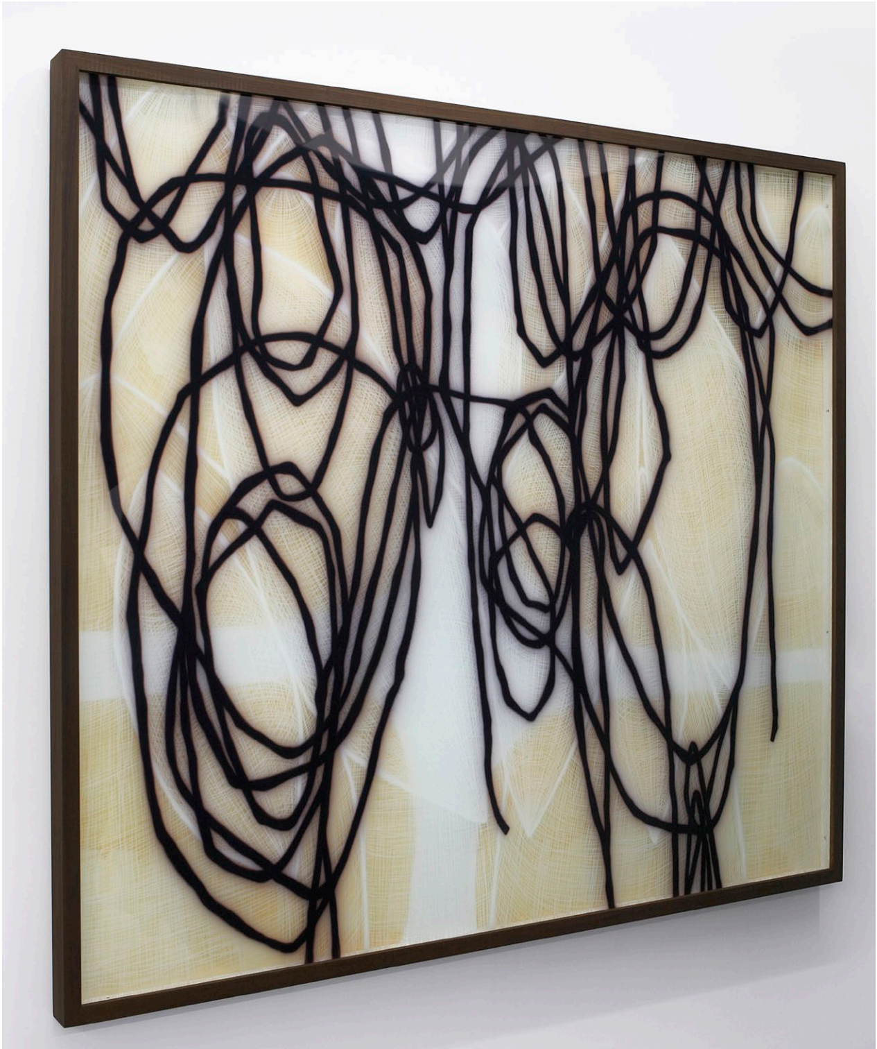
Julio Rondo PLUS DE LIAISON , 2008 Acrylic behind glass 154 x 180 x 6 cm Unique