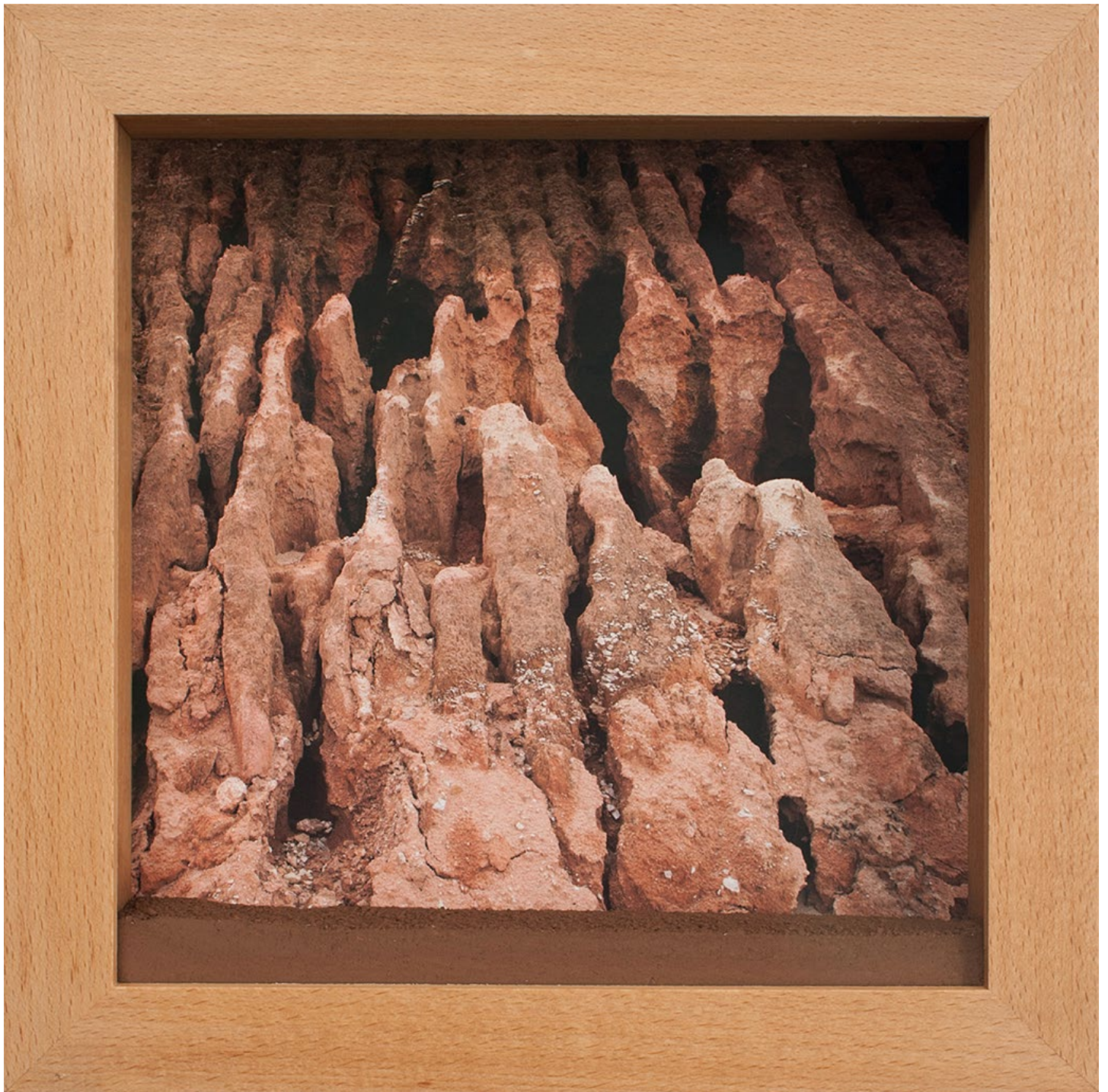
Pedro Motta Falência , 2018 Mineral print on cotton paper and mineral pigment 42 x 42 x 7 cm Edition : 5+2 AP