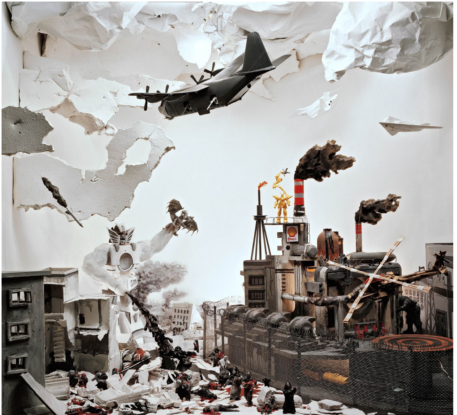
Norton Maza Architecture des ombres , 2009 Series : El delirio de los sabios Lambda Print 137 x 125 cm | 141.5 x 153.5 x 5 cm (Frame) Édition : 3