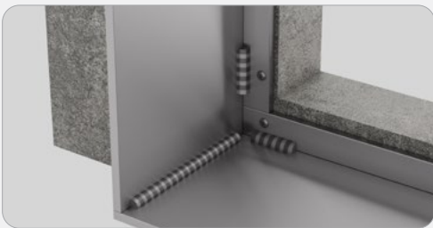
INTERNAL FLANGE FIXING DETAIL