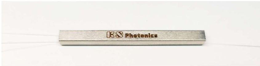
MCF Fan-in/Fan-out, MCF Pump combiner

Directional coupling for selective cores with low loss