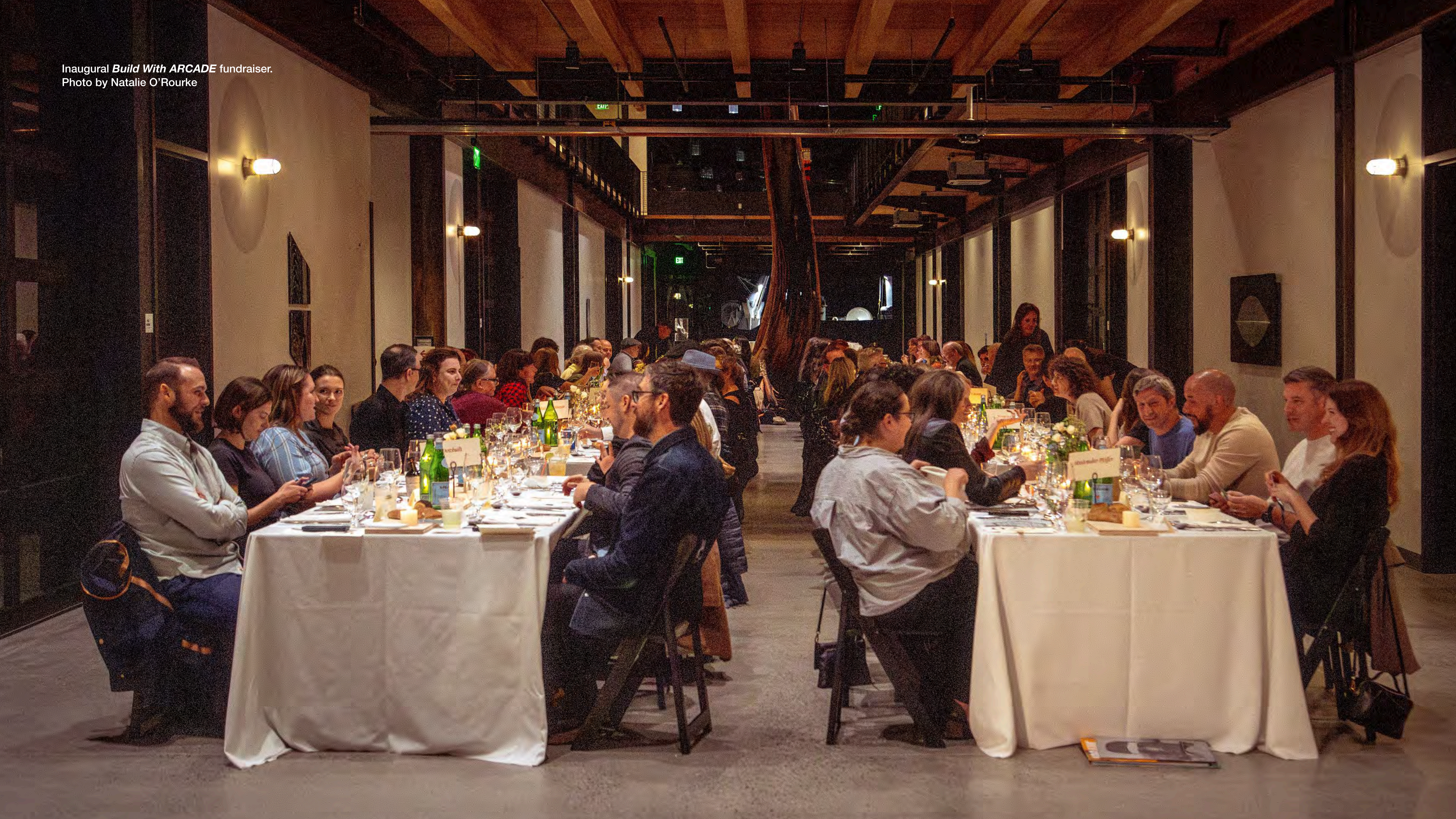
Inaugural Build With ARCADE fundraiser.