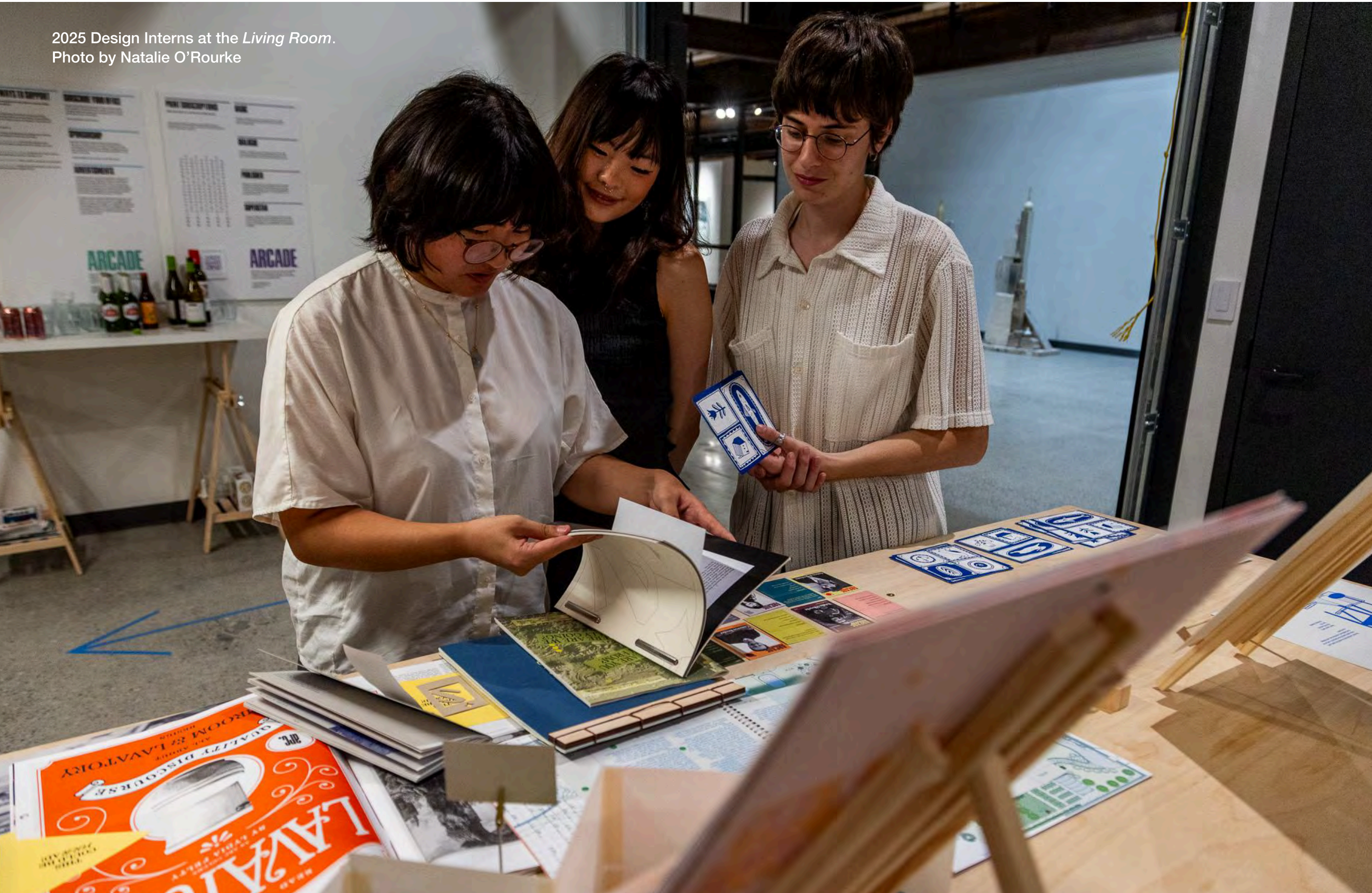
2025 Design Interns at the Living Room.

ARCADE is committed to amplifying emerging voices, particularly students' and early-career writers, with a sustained focus on the built environment. ARCADE values providing opportunities and preserving meaningful pathways into cultural publishing, criticism, and literary fields.