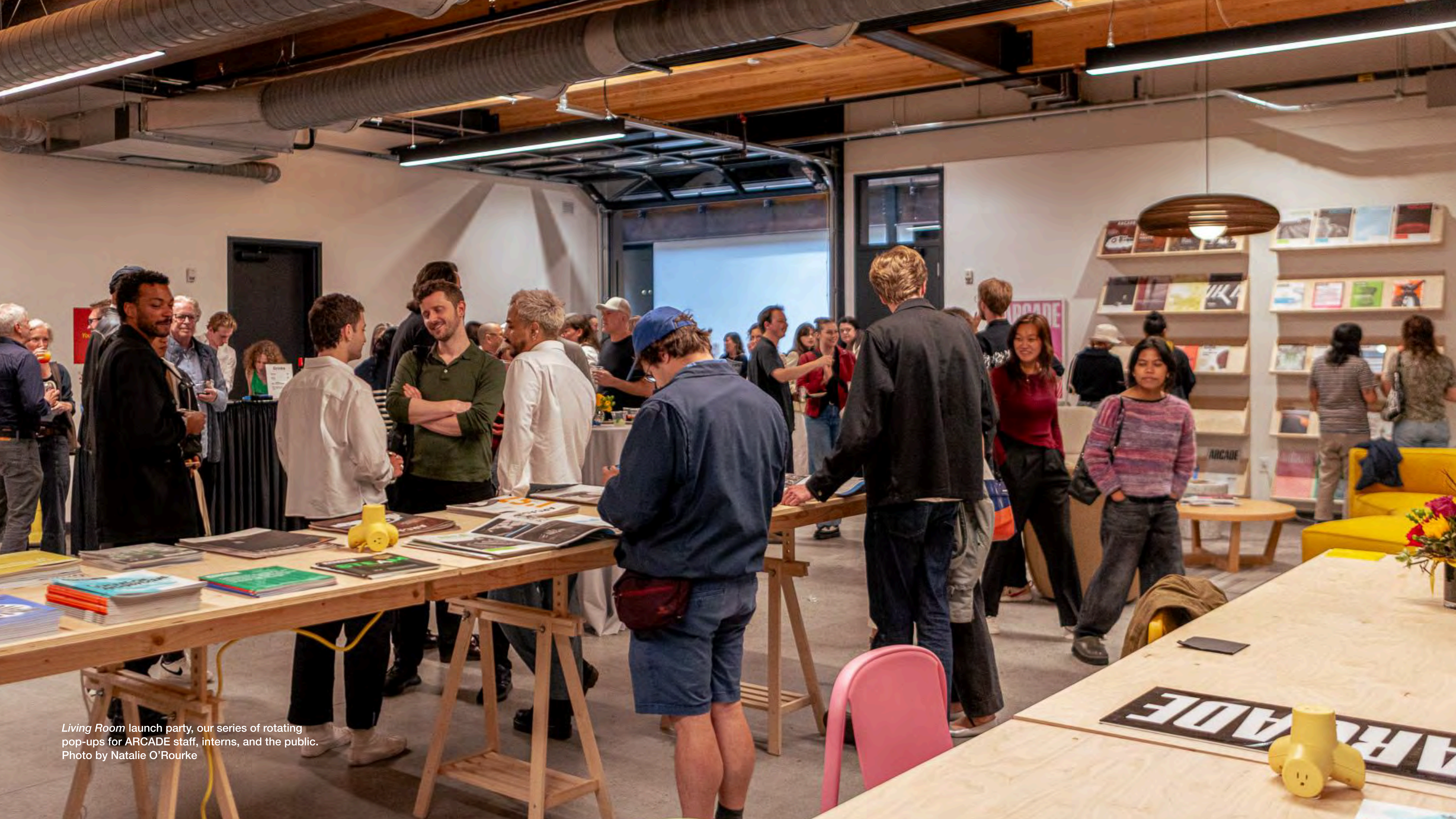
Living Room launch party, our series of rotating pop-ups for ARCADE staff, interns, and the public.