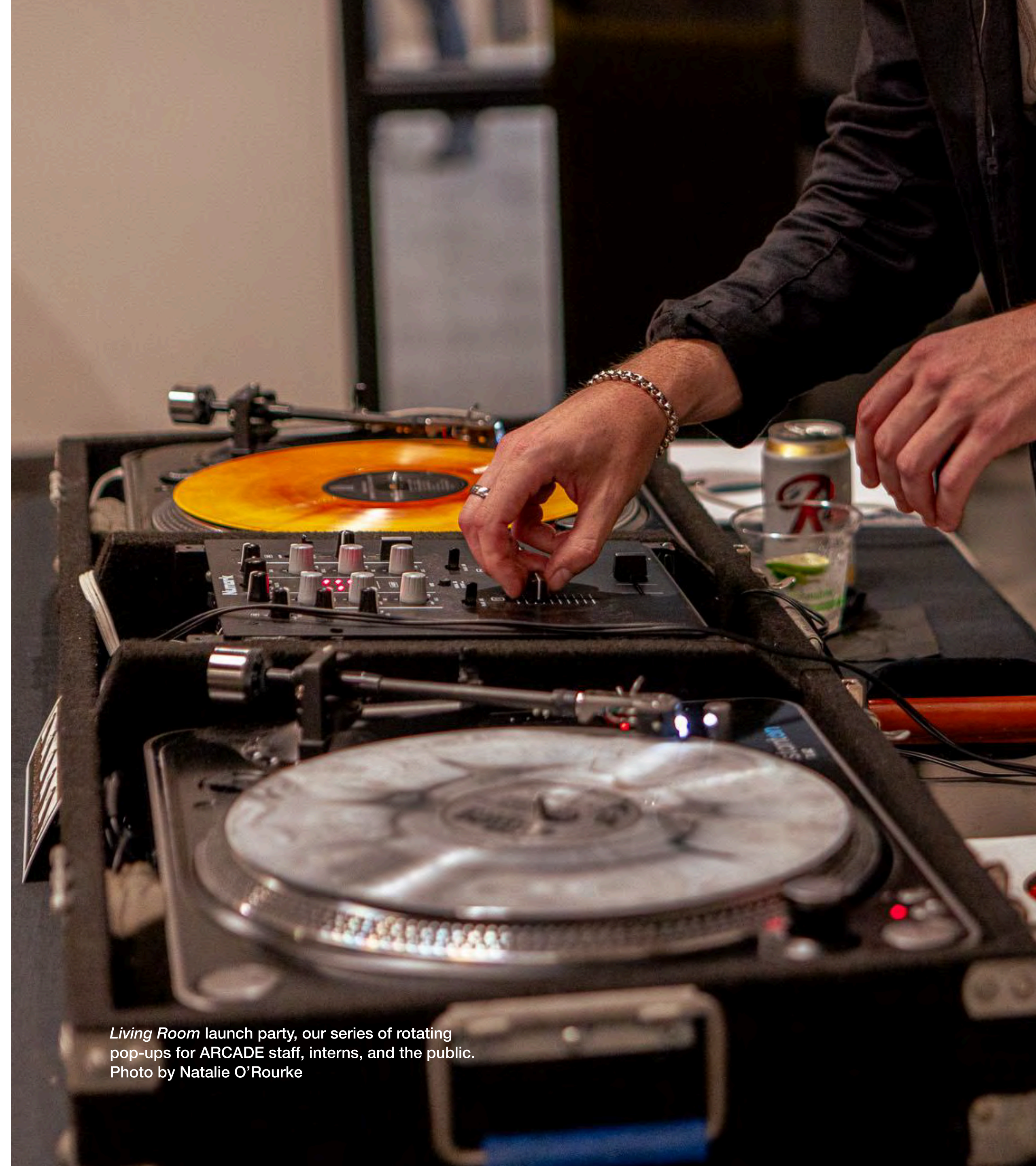
Living Room launch party, our series of rotating pop-ups for ARCADE staff, interns, and the public.

local architecture and design organizations