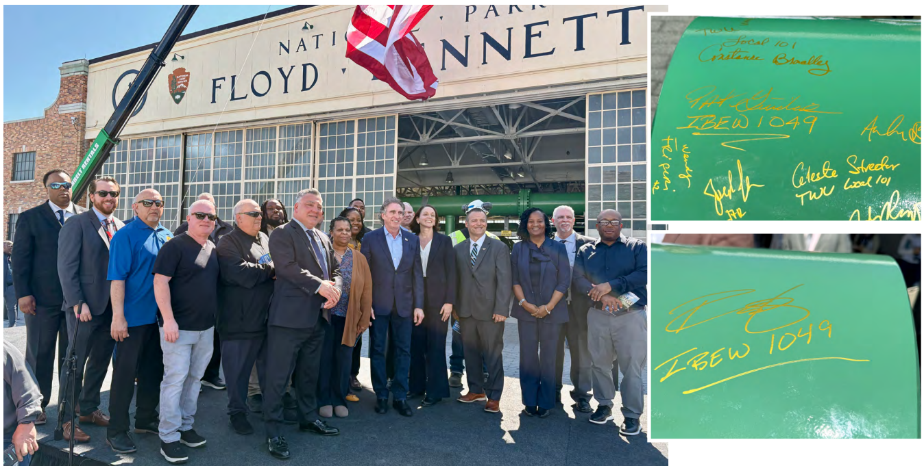
IBEW 1049 Leadership played a critical role in getting the NESE construction off the ground.

The benefits that NESE will provide to our union and Long Island as a whole will be substantial and we are proud to have played a part in bringing it to life.