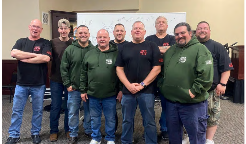
The IBEW Local 1049 Sports and Outdoors Committee is looking for new members to provide new energy, perspectives and ideas to bolster the opportunities it provides for membership and their families.

Committee meetings are held on the second Monday of each month at 5:30 p.m. We encourage anyone interested to attend, meet the committee and see what we're all about. Help us build bigger and better events for the membership and become part of the team that makes them happen.