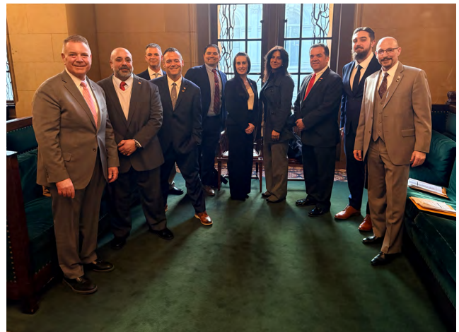
IBEW Local 1049 met with a number of state elected officials to advocate for workers' needs.