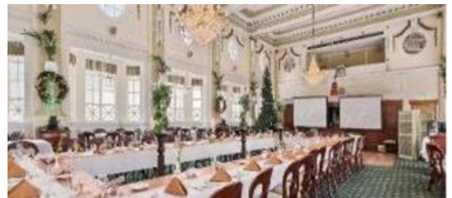
CELLOS ROOM 4 TH FLOOR.

THE CLUB'S 4 th BI-MONTHLY LUNCHEON FOR 2025 WILL BE HELD AT THE CASTLEREAGH BOUTIQUE HOTEL SYDNEY WITH DETAILS: -