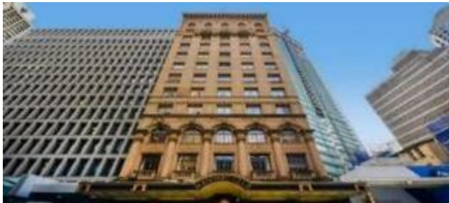
CASTLEREAGH BOUTIQUE HOTEL