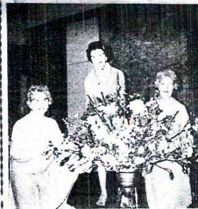
Box Hill Horticultural Society at work.

BEAUTIFUL GIRLS from Melbourne and wildflowers from Western Australia made a perfect combination for the opening of the new Stock Exchange branch.