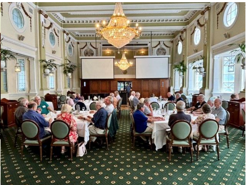
ANZROC (NSW) BOUTIQUE LUNCHEON 20 October 2025