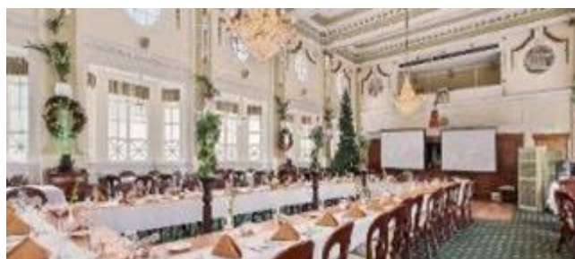
CELLOS ROOM 4 TH FLOOR.

THE CLUB'S 1 ST BI-MONTHLY LUNCHEON FOR 2026 AND CLUB AGM WILL BE HELD AT THE CASTLEREAGH BOUTIQUE HOTEL SYDNEY WITH DETAILS: -