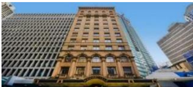
CASTLEREAGH BOUTIQUE HOTEL