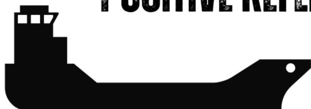
Four square ship