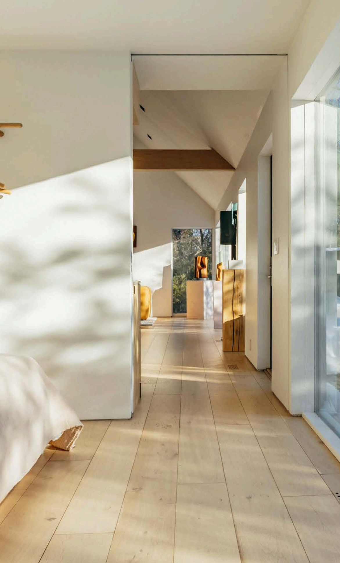
Buyer to confirm all pertinent information including square footage, property taxes, short term rental restrictions, allowable uses.