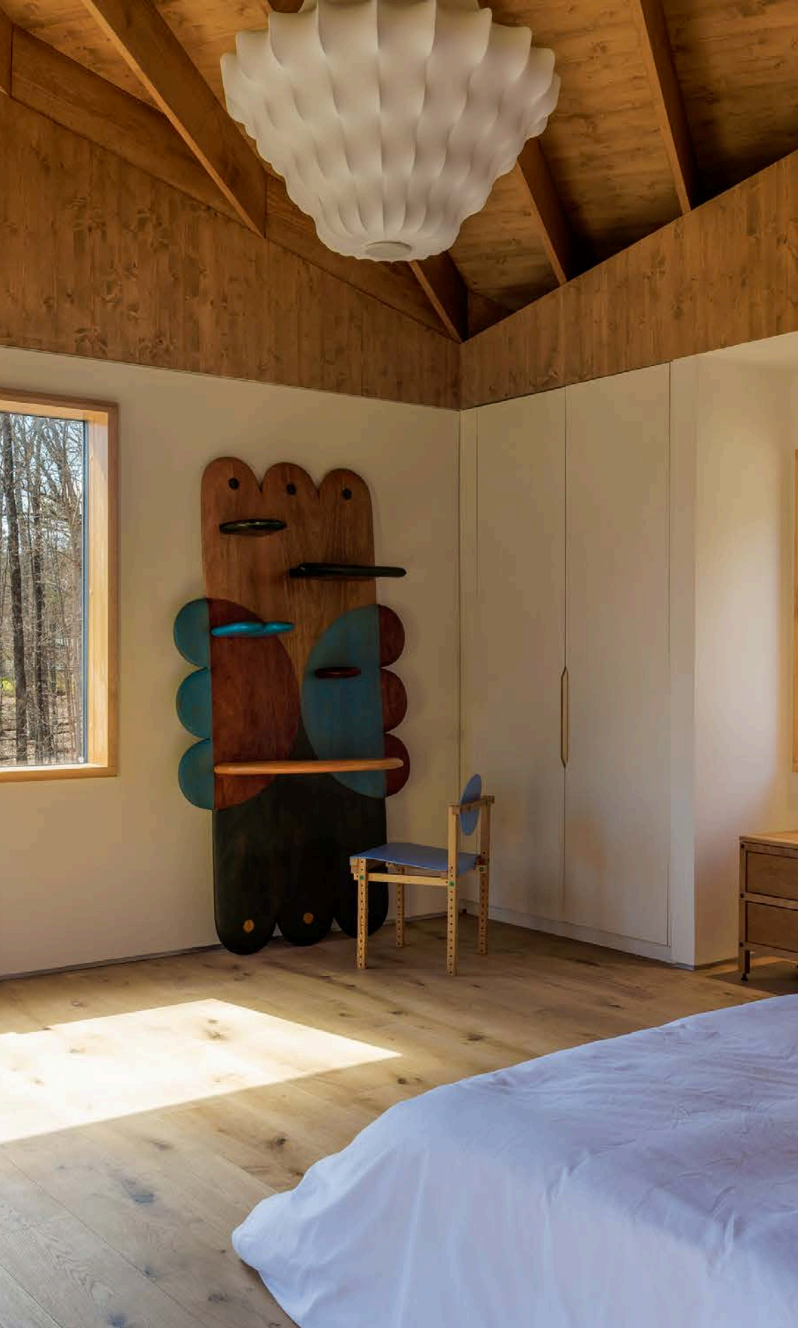
Buyer to confirm all pertinent information including square footage, property taxes, short term rental restrictions, allowable uses.