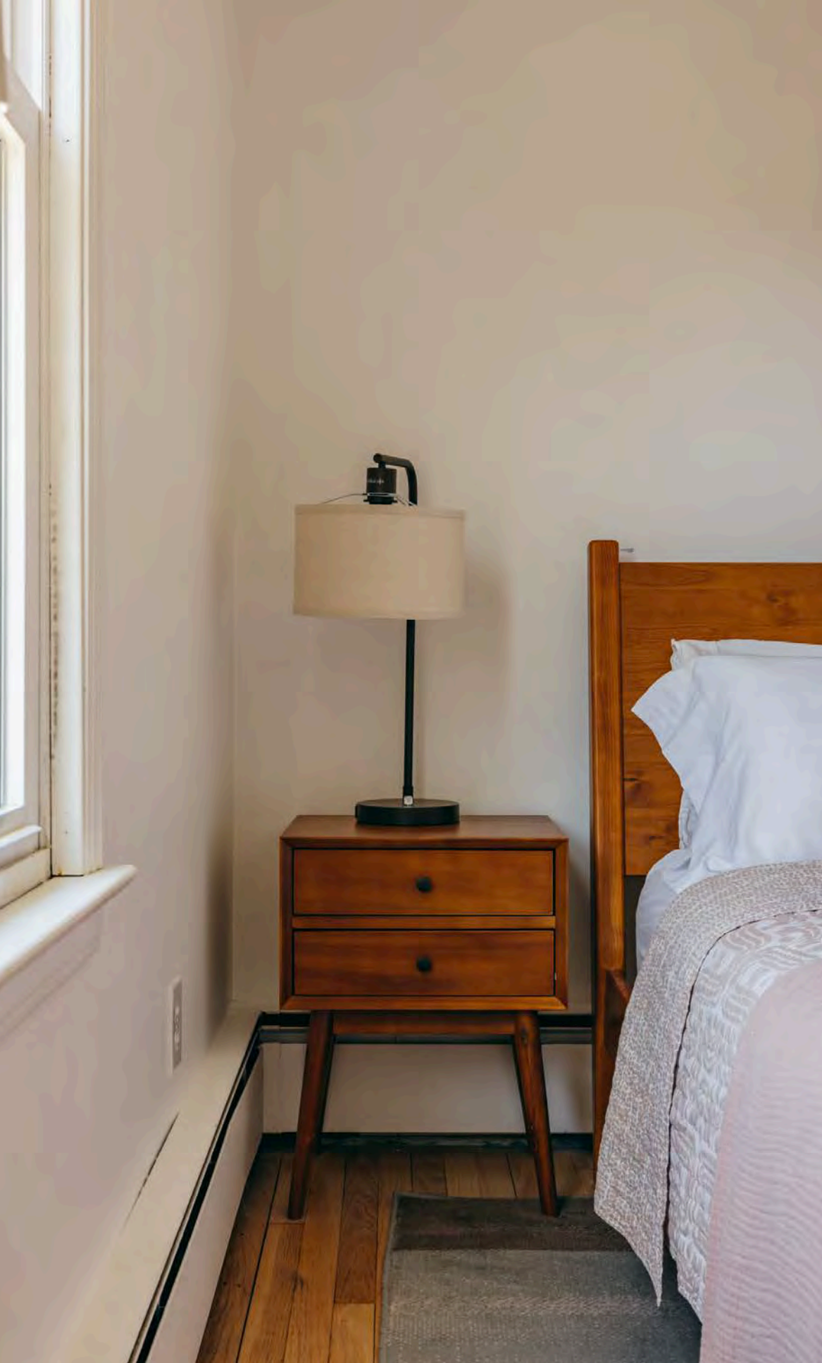
Buyer to confirm all pertinent information including square footage, property taxes, short term rental restrictions, allowable uses.