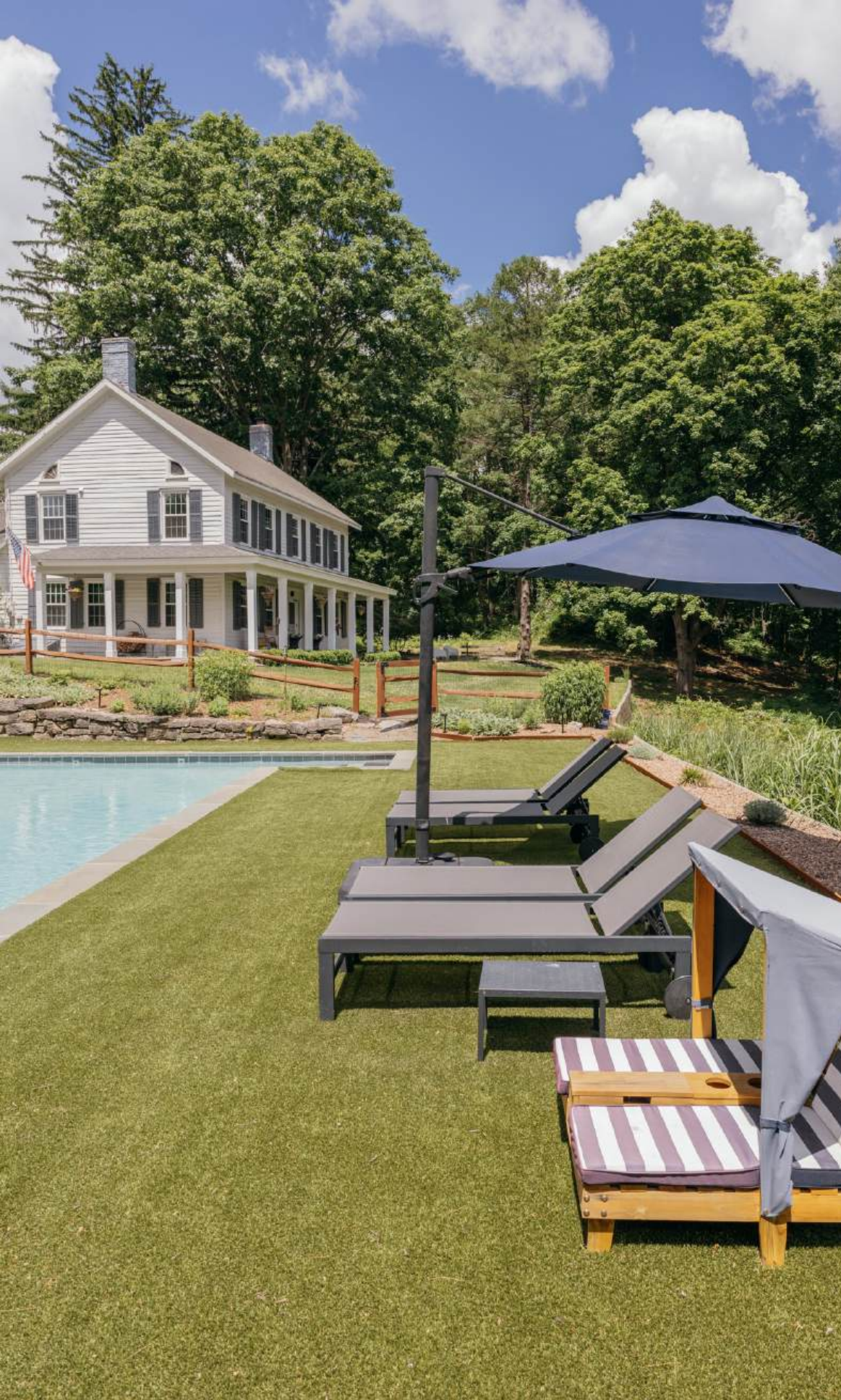
Buyer to confirm all pertinent information including square footage, property taxes, short term rental restrictions, allowable uses.