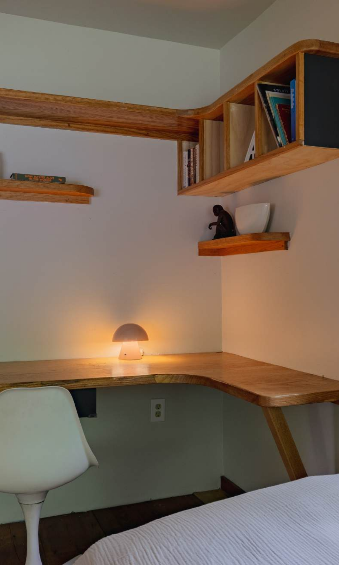
Buyer to confirm all pertinent information including square footage, property taxes, short term rental restrictions, allowable uses.