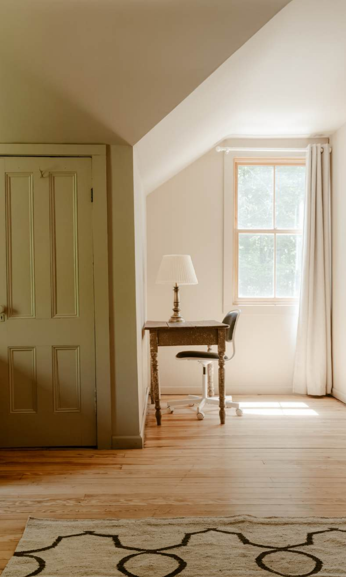
Buyer to confirm all pertinent information including square footage, property taxes, short term rental restrictions, allowable uses.