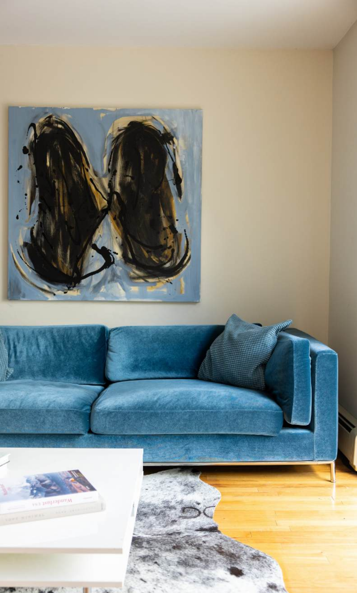
Buyer to confirm all pertinent information including square footage, property taxes, short term rental restrictions, allowable uses.