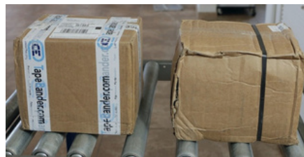
After: Tape-banded carton remained intact; strapped carton failed in transit.