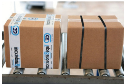
Before image of both packages