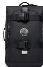
CLUB MINI ROLLING DUFFLE