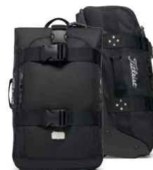
CLUB ROLLING DUFFLE