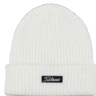
CHARLESTON CUFF KNIT