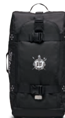
CLUB ROLLING DUFFLE