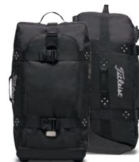
CLUB MINI ROLLING DUFFLE