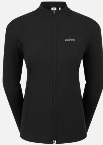
39411 | Black