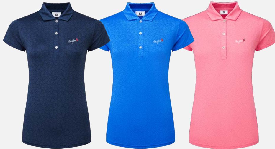
34201 | Navy