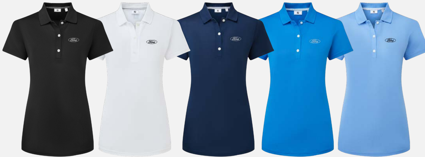
88492 | Black