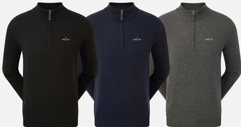
90137 | Black