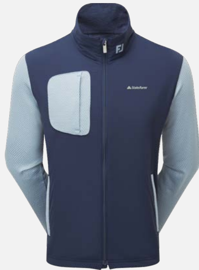
37826 | Heather Charcoal