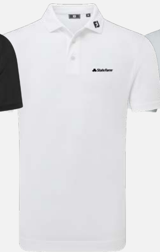
91823 | White