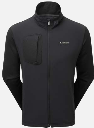
37825 | Black