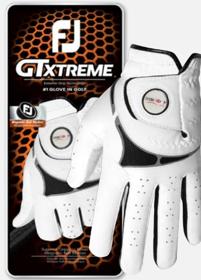
64875E-401 | Men's Regular, Left White 64876E-001 | Men's Regular, Left Black 64878E-401 | Men's Regular, Right White 64880E-401 | Women's Regular, Left White