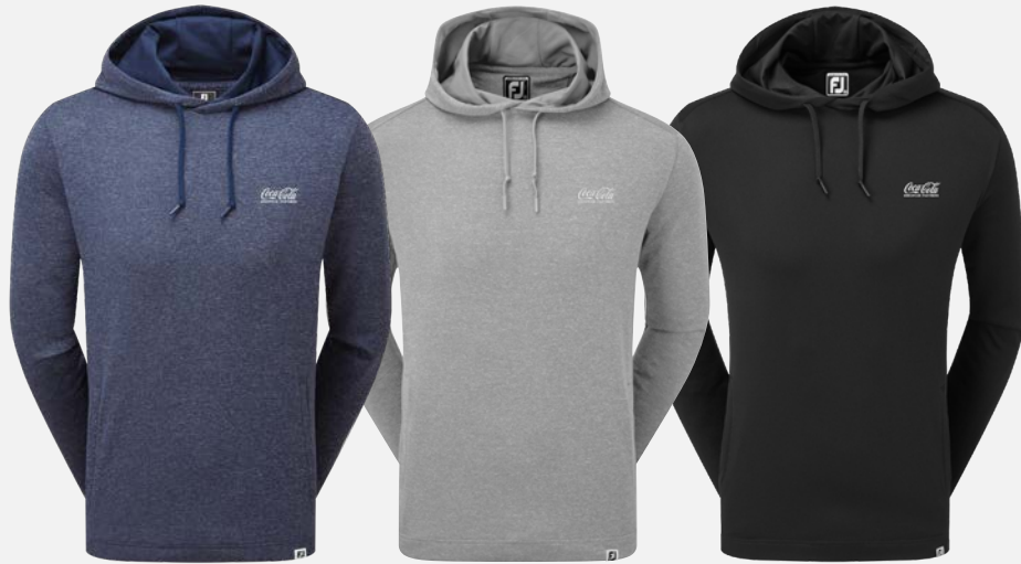
88448 | Heather Navy