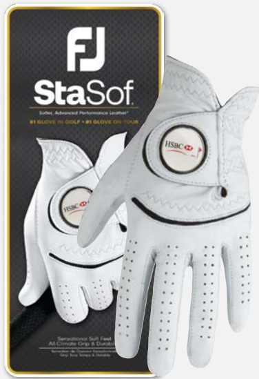
66770E-301 | Regular, Left Pearl