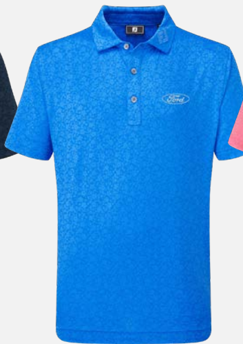
34230 | Cobalt