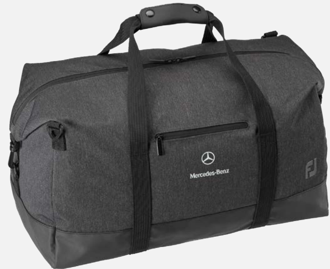
31535 | Heather Charcoal