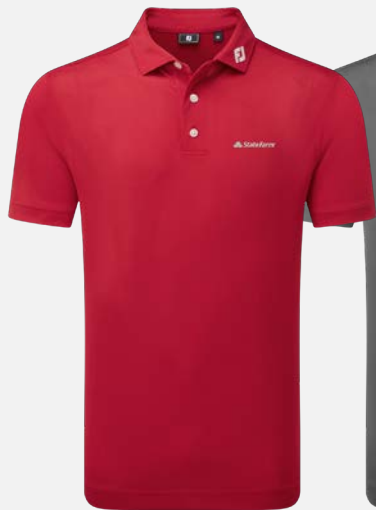
91825 | Red