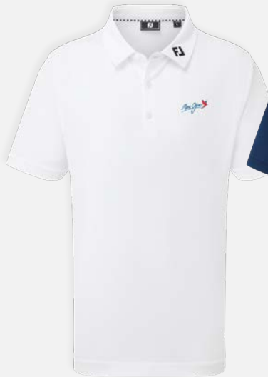
92740 | White