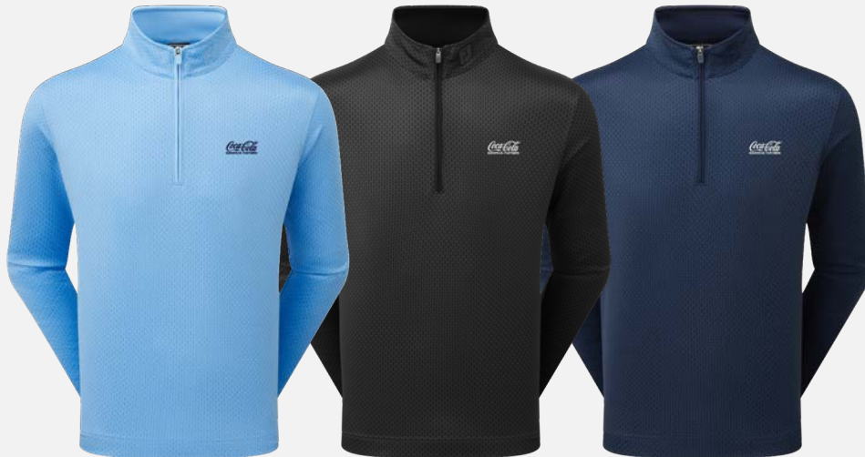
39300 | Blue Reef/Deep Reef