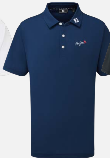
92746 | Navy