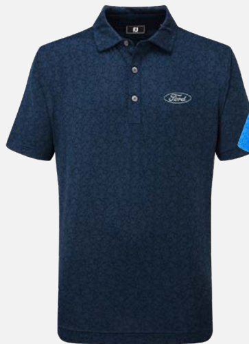
34229 | Navy