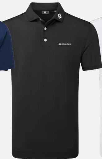
91822 | Black