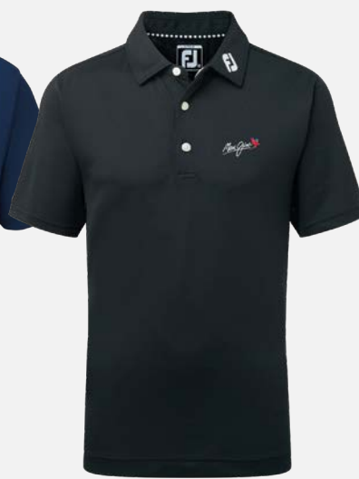
92745 | Black