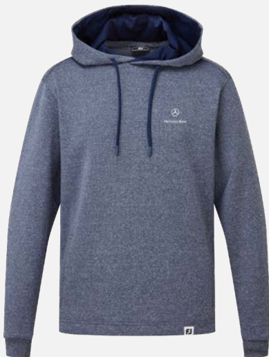
34234 | Heather Navy