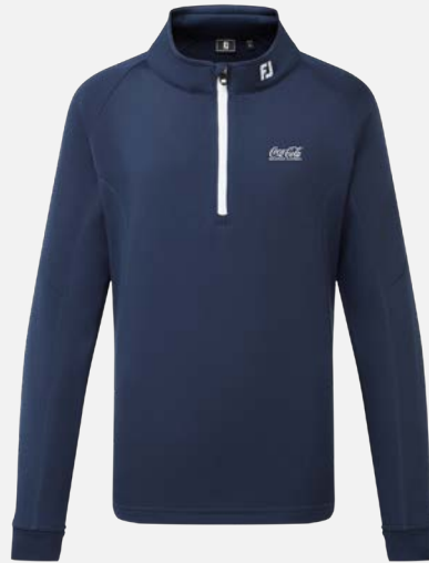
96350 | Navy