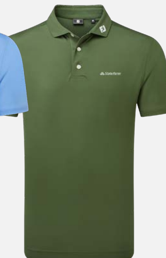
84455 | Olive