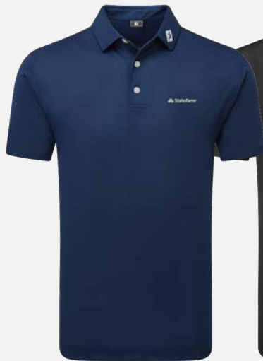
91824 | Navy