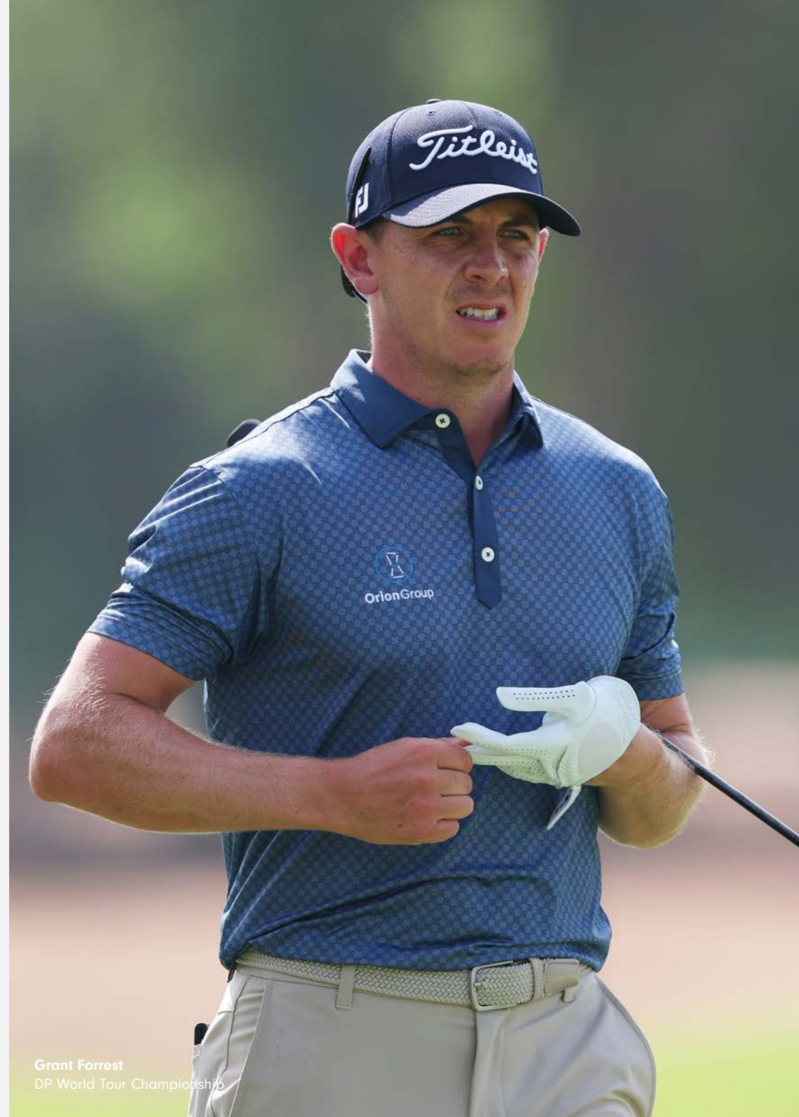
Grant Forrest DP World Tour Championship