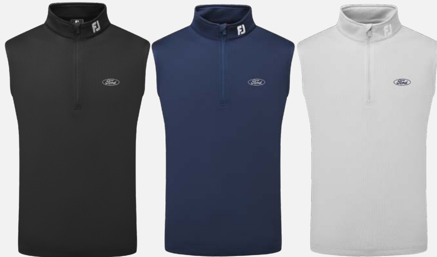
34145 | Black