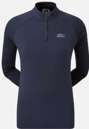
80247 | Navy