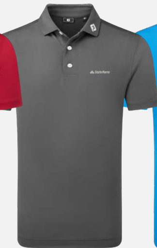
92420 | Charcoal