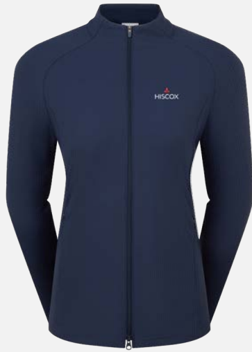
39410 | Navy