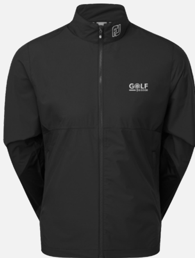
89920 | Navy