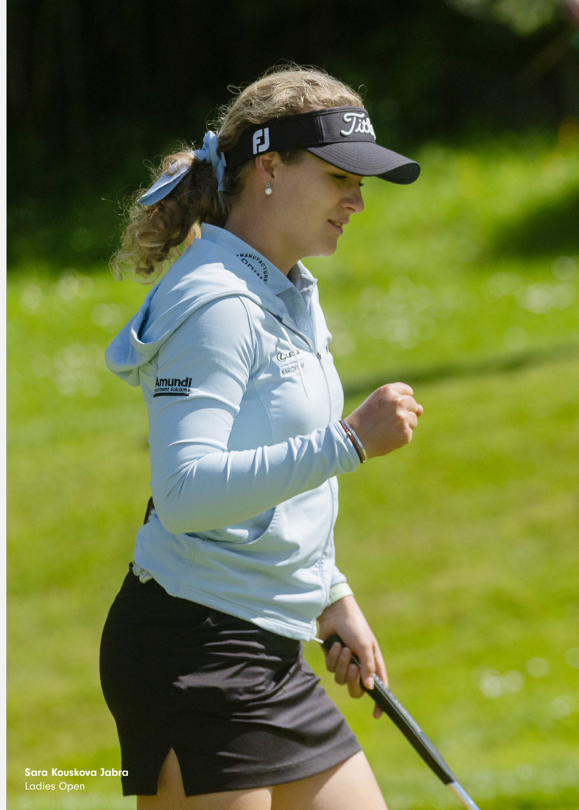
Sara Kouskova Jabra Ladies Open