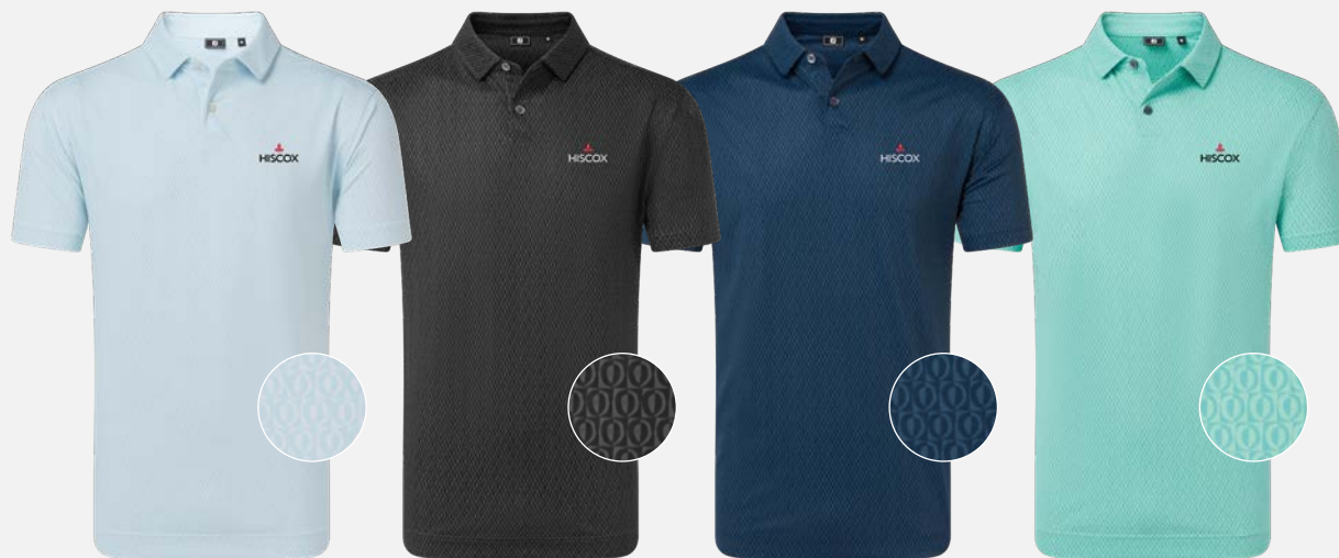
39348 | White/Ice Blue