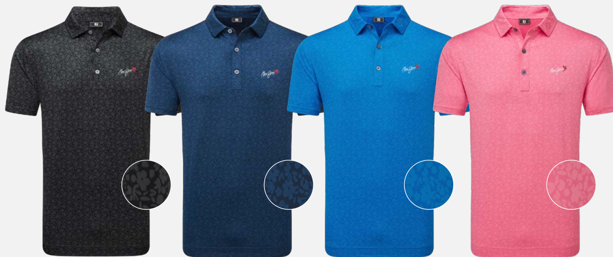
34128 | Black