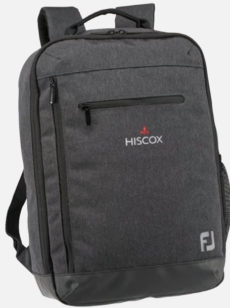
31513 | Heather Charcoal