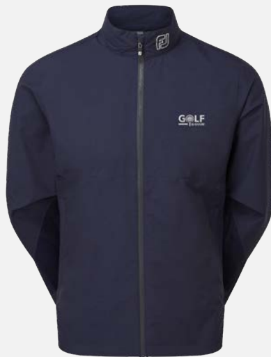
89921 | Heather Charcoal