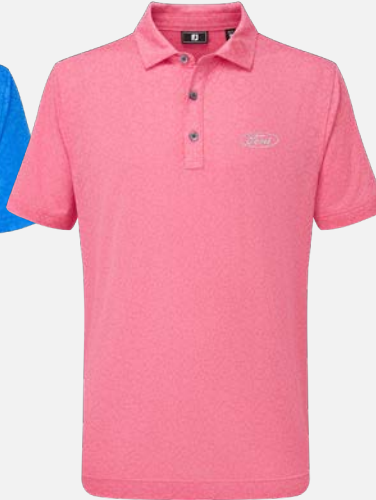
34233 | Pink Lemonade