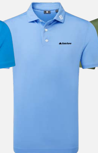
91826 | Light Blue