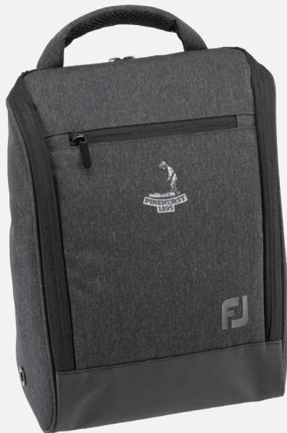
31540 | Heather Charcoal