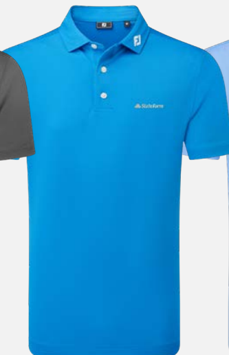
91817 | Cobalt