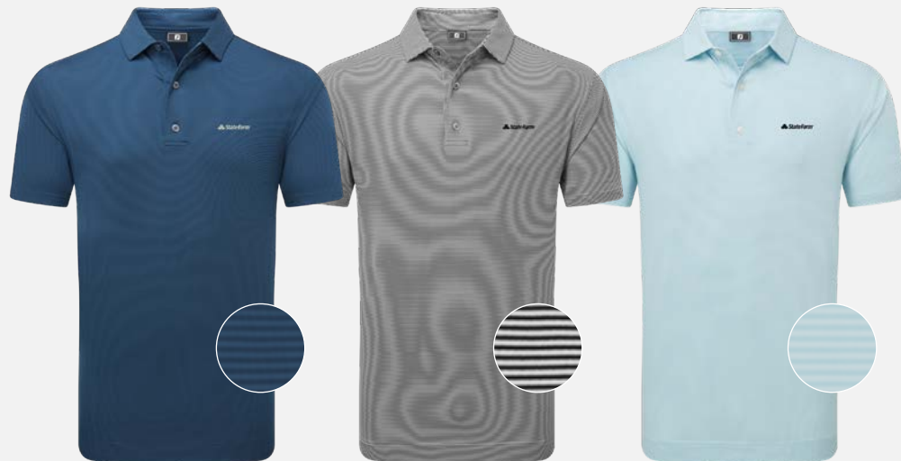
34131 | Navy Tonal