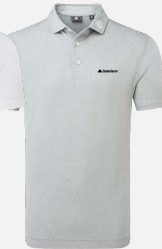
91819 | Heather Grey