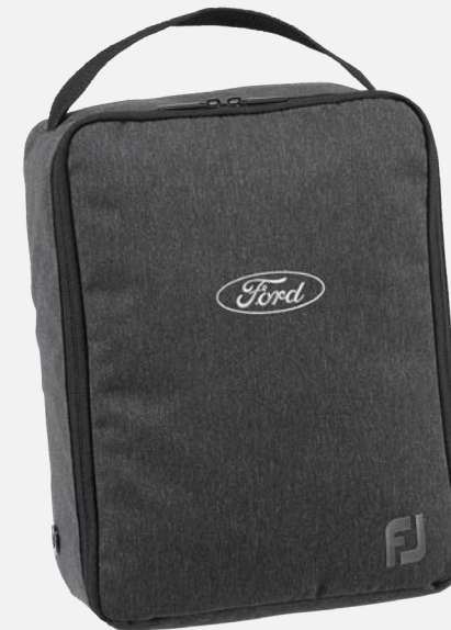
31541 | Heather Charcoal