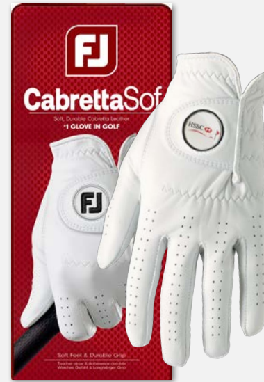
68828 | Men's Regular, Left Pearl 68834 | Men's Regular, Right Pearl 67692 | Women's Regular, Left Pearl 67693 | Women's Regular, Right Pearl