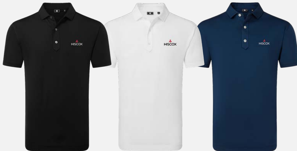
39343 | Black