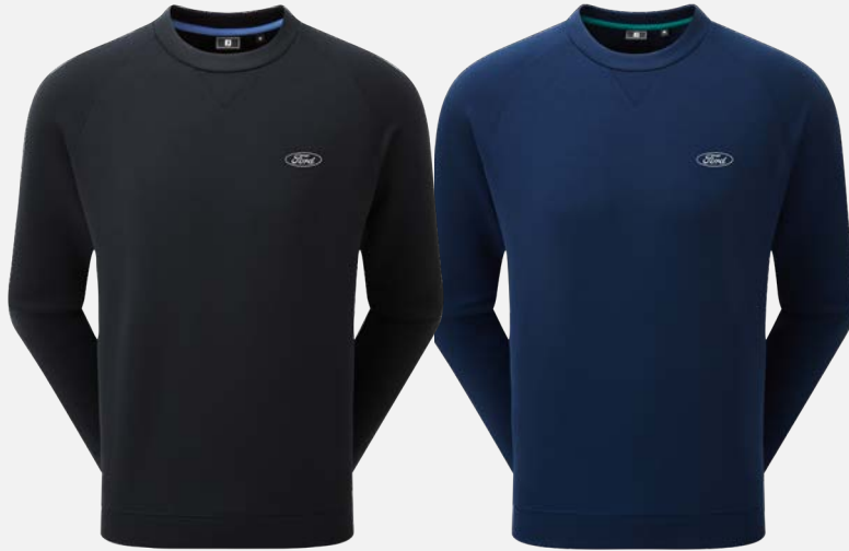
39305 | Black