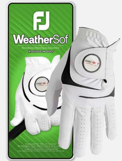
66159E-401 | Men's Regular, Left White 66164E-001 | Men's Regular, Left Black 66161E-401 | Men's Regular, Right White 66980E-401 | Women's Regular, Left White 66207E-001 | Women's Regular, Left Black 66222E-401 | Women's Regular, Right White