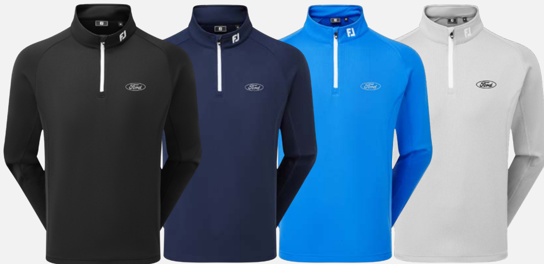
90146 | Black