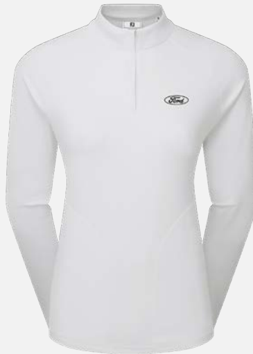
34218 | White