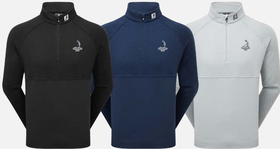
31968 | Black