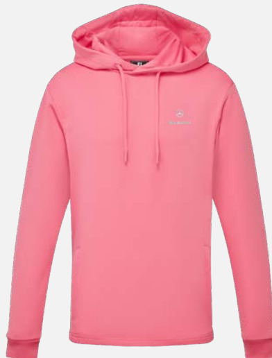
34235 | Pink Lemonade