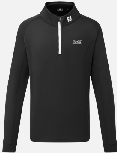
96349 | Black