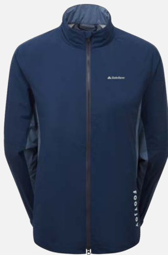
37856 | Navy / White Dot