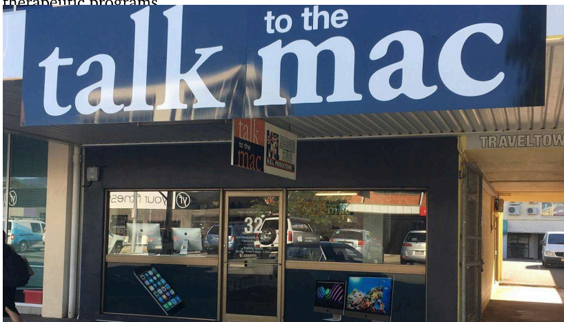
Business Breaking News

Proceeds from the IPO would primarily be used to advance Benitec's therapeutic programs.