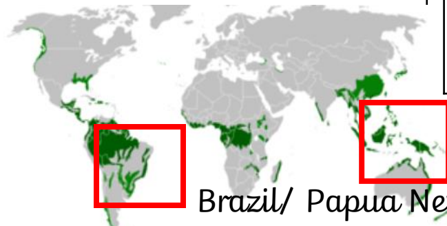
Brazil/ Papua New Guinea