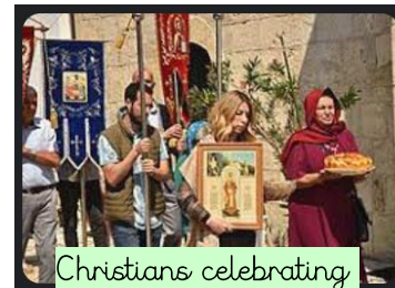
Christians celebrating Pentecost.