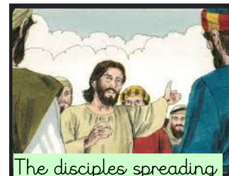
The disciples spreading the message of god.