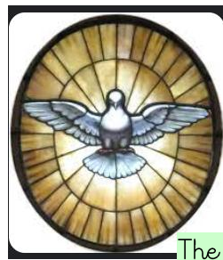
The holy spirit