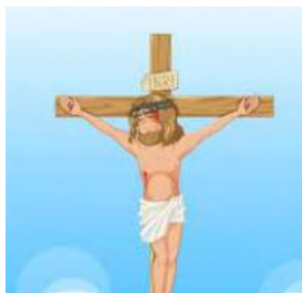
The death of Jesus on Good Friday.