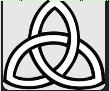
The symbol of the Holy Trinity.