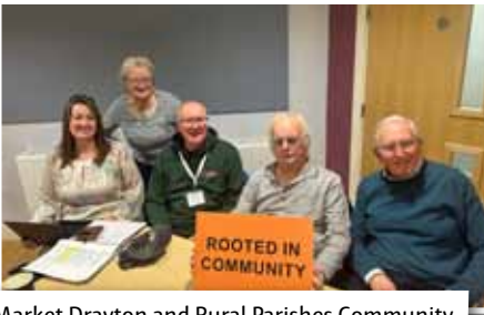
Market Drayton and Rural Parishes Community Covenant has been a great success

Party conference to talk about this exciting initiative and to share learning that is influencing how neighbourhood governance will be implemented throughout the new English Devolution and Community Empowerment Bill.