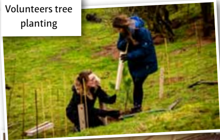
Volunteers tree planting