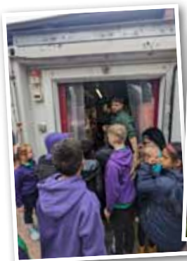
School visits in 2025

They couldn't stop talking about their day; they were so excited to share the