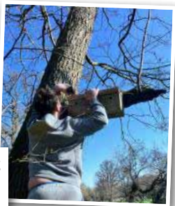
Youth Project putting up homemade bird boxes

"I actually like nature now I've been coming here. I'm more of a nature person than I was before. I help my dad in the garden."