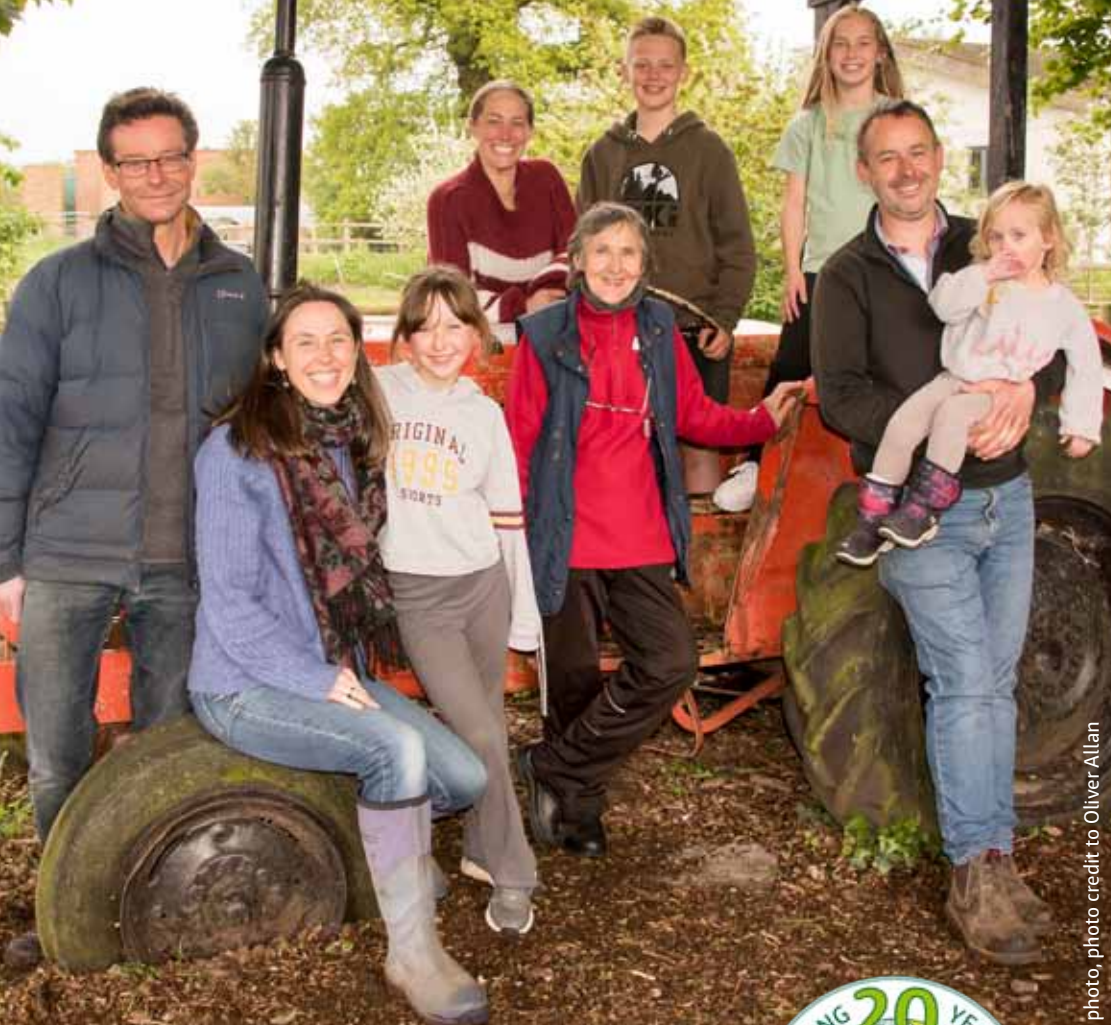
Family photo

Proud to be community-owned 1 farmer, 8,000 landlords