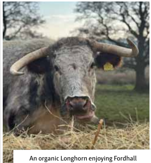
An organic Longhorn enjoying Fordhall haylage this winter. Able to live a happy life because you believed in us

We do not believe that at Fordhall. We do believe in the combined power of small actions for a common good. Saving Fordhall Farm against the odds in 2006 proved this to us.