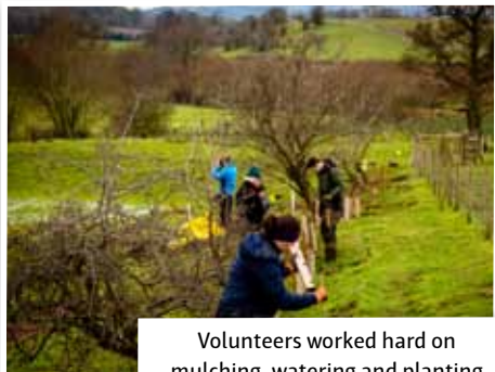
Volunteers worked hard on mulching, watering and planting trees during the winter periods

enough, so many had to be replanted this winter. We are actively looking at how we can