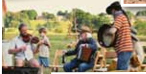
Parties and events