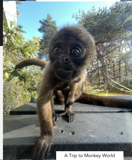
A Trip to Monkey World

Throughout the term, our Zoo students have enjoyed a range of varied trips and experiences. Highlights included a visit to Monkey World, a hands-on pond dipping session, and a trip to Bristol Activity Centre, where students had the opportunity to bond during enrolment week. Our Zoological Management & Conservation students have also had a busy term fundraising in preparation for their upcoming trip to the Philippines.