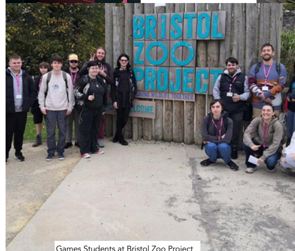
Games Students at Bristol Zoo Project

Throughout this academic year, our Game Art and Game Design & Development students have enjoyed several exciting trips. A standout from this semester was their visit to the Bristol Zoo Project, where students explored the zoo and practised their drawing skills along the way.