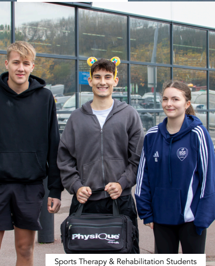
Sports Therapy & Rehabilitation Students