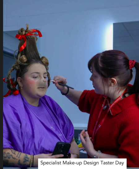
Specialist Make-up Design Taster Day

The taster day offered an engaging and informative insight into future academic and creative pathways available to students at SGS.