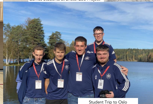
Student Trip to Oslo