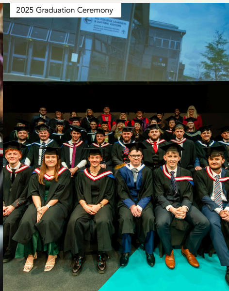
2025 Graduation Ceremony