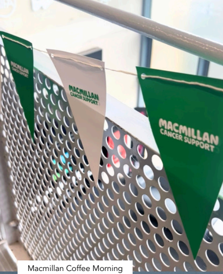
Macmillan Coffee Morning