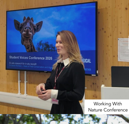
Working With Nature Conference