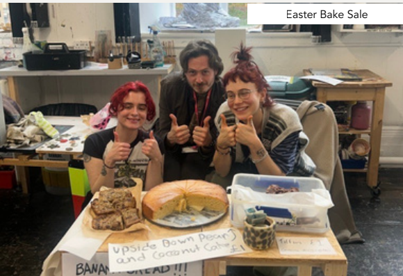
Easter Bake Sale