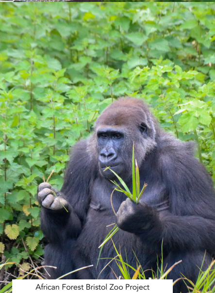
African Forest Bristol Zoo Project

The visit offered an inspiring and memorable learning experience, strengthening students' understanding of contemporary conservation work and the importance of evidence-based animal care.