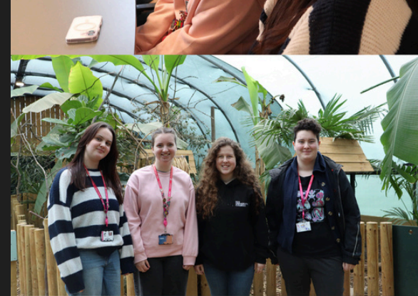
Women in Wildlife

Students also had the chance to learn more about the exciting opportunities available through the society, including networking, events, skills development, and ways to connect with others who share a passion for wildlife and conservation