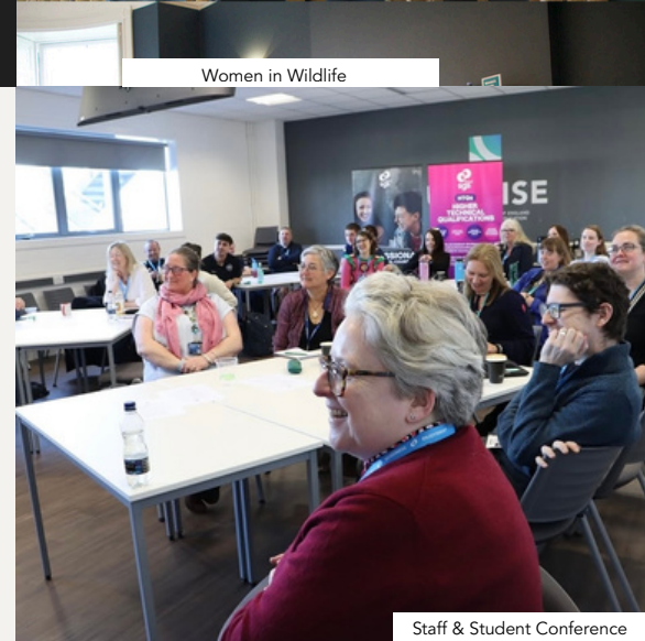
Staff & Student Conference

The sense of communication, collaboration, and pride throughout the day was truly inspiring.