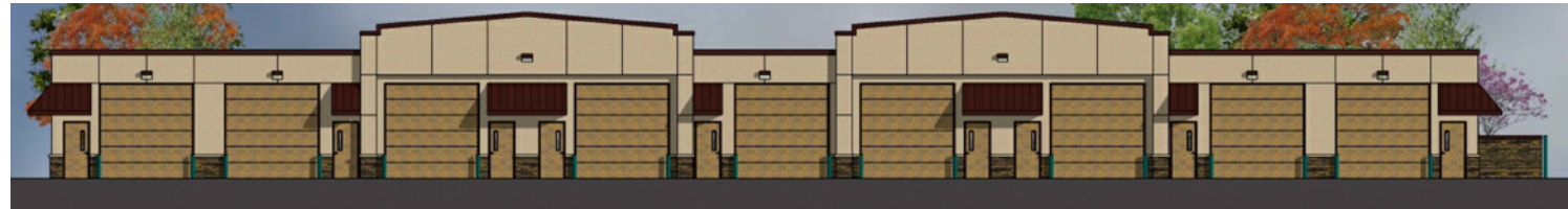
EAST ELEVATION-FULLY DEVELOPED