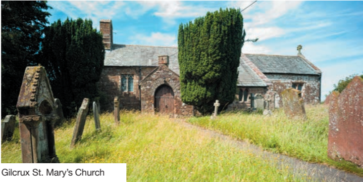
Gilcrux St. Mary's Church