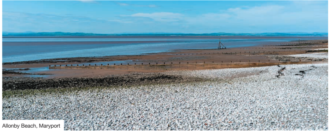
Allonby Beach, Maryport