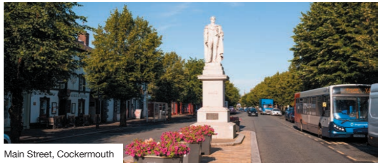
Main Street, Cockermouth