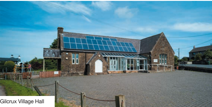
Gilcrux Village Hall

Peaceful and untouched, life here moves at an easy pace, with birdsong drifting on the breeze and country walks winding along flower-lined hedgerows. Beyond the lanes, distant views shimmer toward the Solway Coast, and the landscape opens endlessly in every direction, enfolding each home in the gentle sweep of the countryside. And while it feels wonderfully tucked away, the world beyond the village is never far.