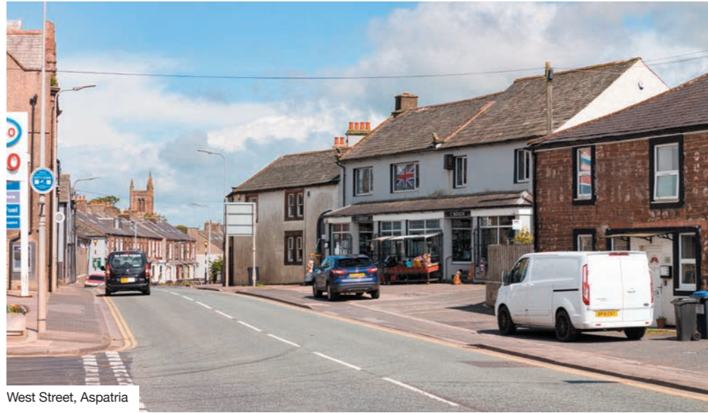
West Street, Aspatria

Just a few minutes’ drive away, Aspatria buzzes quietly with everyday life. Schools, a supermarket, post office and petrol station sit around the main street for the daily essentials, while the library, gym, parks and sports clubs give families plenty to do. For work or venturing a little further, the train station offers links west to Whitehaven and north to Carlisle.