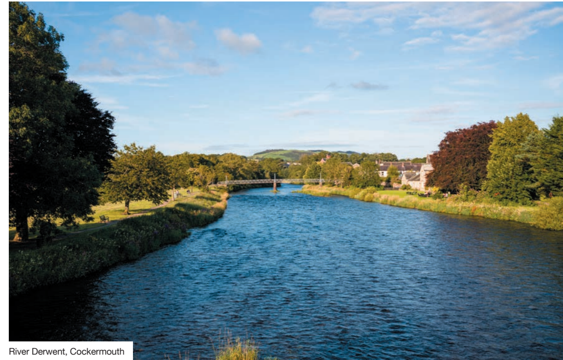
River Derwent, Cockermouth

A handsome town of Georgian streets, colourful shops and local flavour, Cockermouth has unmistakable charm. Its independent boutiques, wine bars and cafés are perfect for a weekend wander or midweek coffee, while artisan bakeries, family-run butchers, supermarkets, and healthcare services provide for day-to-day living.