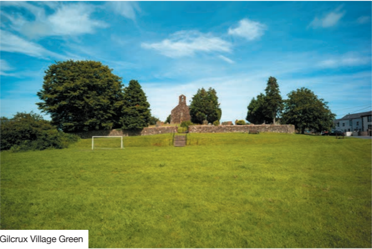
Gilcrux Village Green