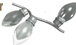
Photo Contest Entries Due by September 26

Don't forget the annual Christmas Lighting Ceremony in Cannonsburg on Monday, December 1st at 6:00 pm