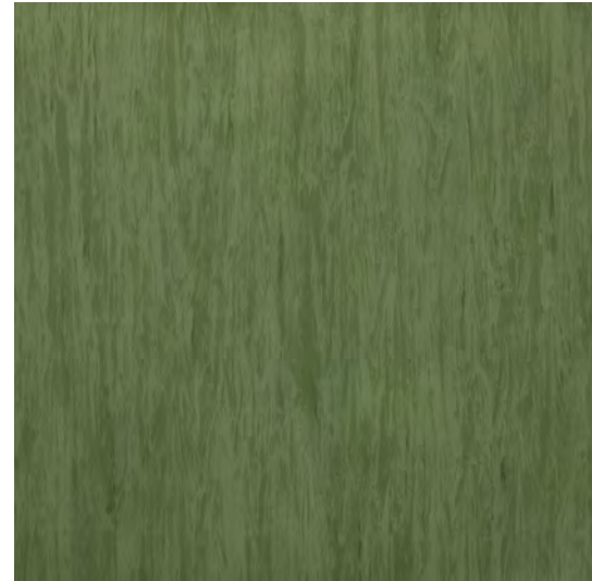
Dark Green 921