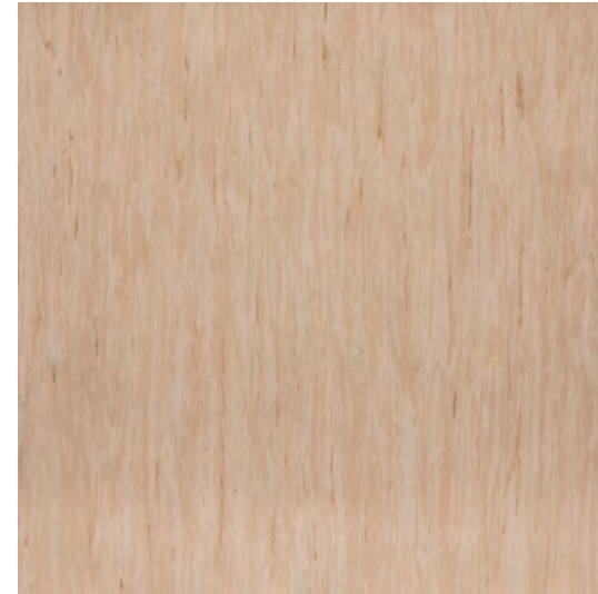
Light Beige 479