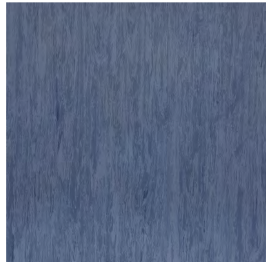
Medium Blue 493