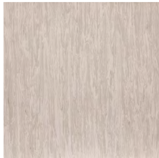
Stone Grey 924