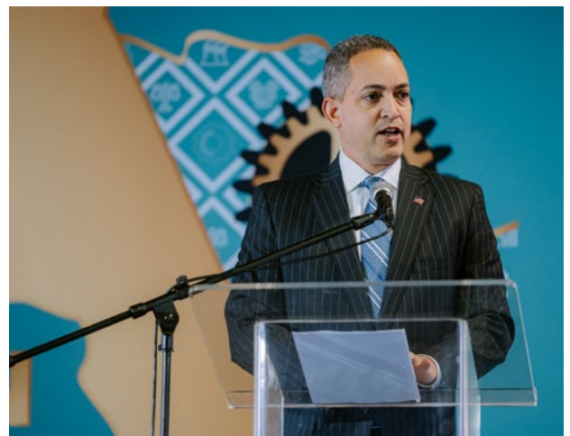
Don Graves, Deputy Secretary of Commerce, U.S. Department of State