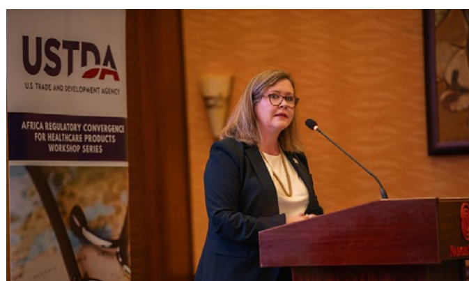
Heather Lannigan, USTDA Regional Director for Sub-Saharan Africa

On November 13-14, 2023, USTDA held the first of five meetings organized by Corporate Council on Africa (CCA) on regulatory convergence for healthcare products. The first workshop focused on East and Central Africa and was held in Nairobi, Kenya. The two-day program included one day dedicated to pharmaceuticals and the second dedicated to medical devices. The event convened a select group of key stakeholders including decision makers from five African Regulatory Authorities, leadership from the U.S. Food and Drug Administration and more than 100 pharmaceutical and medical device companies.