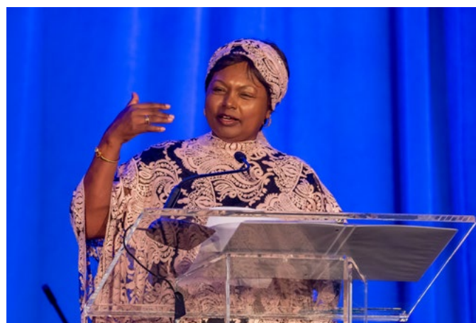
Ambassador Mathilde Mukantabana, Ambassador of the Republic of Rwanda to the U.S. Deputy Dean of the African Diplomatic Corps