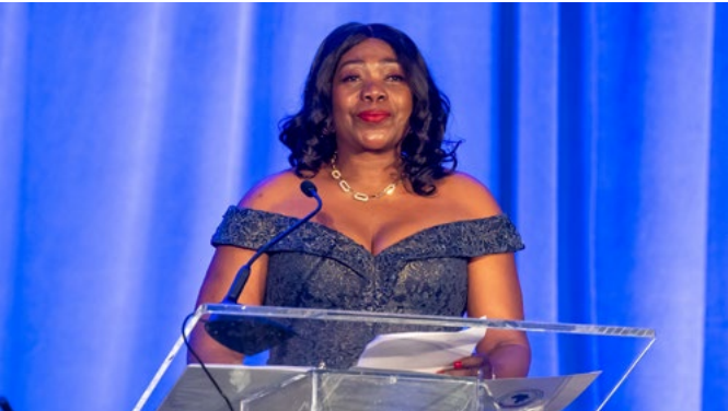
Ambassador Hilda Suka-Mafudze, Ambassador of the African Union to the United States