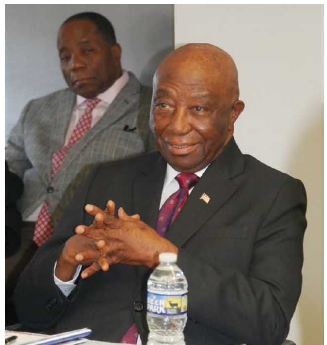
H.E. Joseph Boakai, President-Elect, Republic of Liberia

Special Representative for Commercial and Business Affairs at the U.S. Department of State, Sarah Morgenthau, underscored the Biden Administration's commitment to promoting private sector-led trade and investment between the United States and Africa. "At the heart of this is the simple notion that American and African business shares a spirit of entrepreneurship, a willingness to take risks, and the ability to innovate that will shape a quintessential 21st century partnership," said Morgenthau.