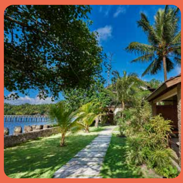
A Water's Edge room in Cocotinos, Manado