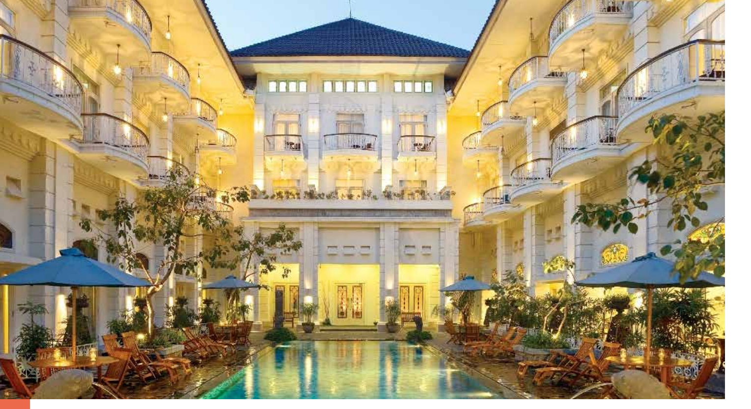
The Phoenix Hotel