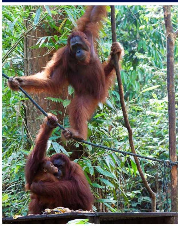
Annah Rais Longhouse (top); Bunaken Green Turtle, CSR-Semenggoh Wildlife Centre (above)