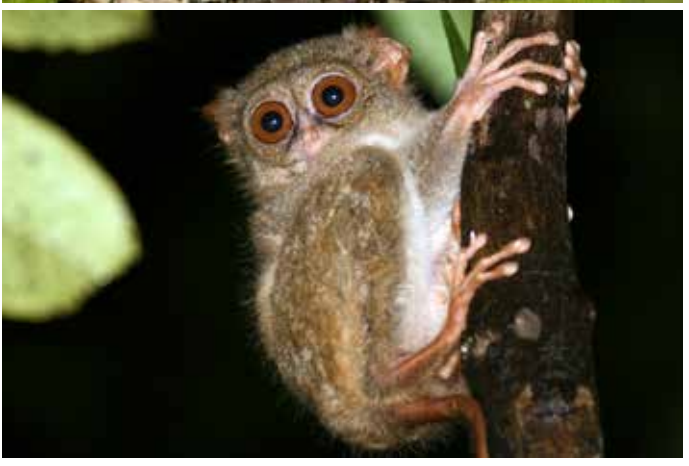
Sarawak River from above (top); Probiscus Monkey in Bako National Park, Sarawak; Prambanan Temples, Yogyakarta; Spot the tiny tarsier in Manado (above)