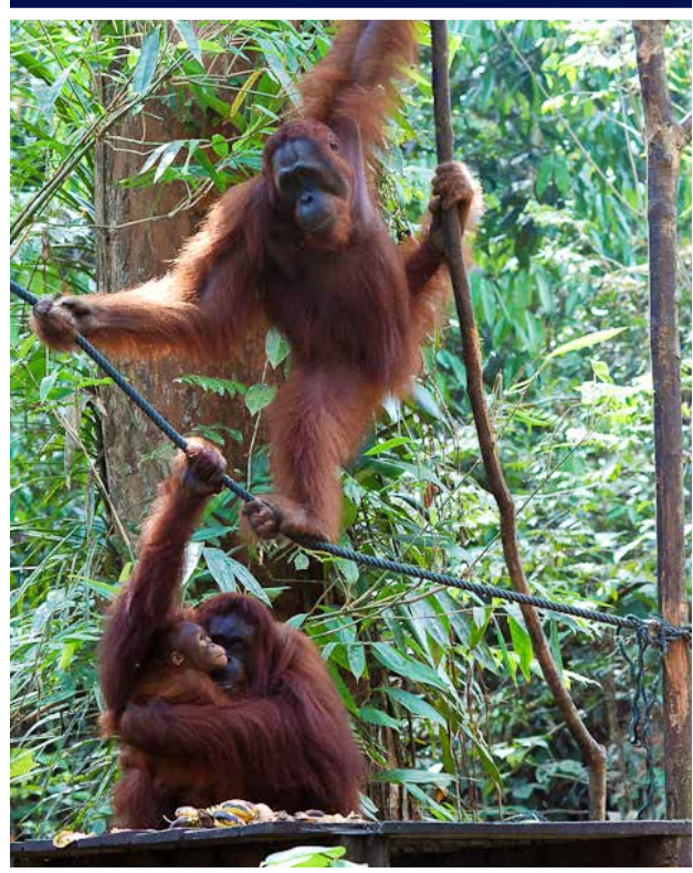
Annah Rais Longhouse (top); Bunaken Green Turtle, CSR-Semenggoh Wildlife Centre (above)