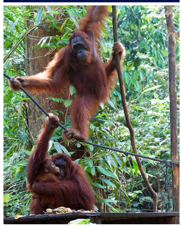
Annah Rais Longhouse (top); Bunaken Green Turtle, CSR-Semenggoh Wildlife Centre (above)