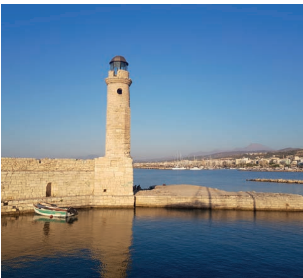
The Egyptian lighthouse

Fronting Chania's glorious Venetian harbour, Porto Veneziano offers romantic views with an attractive bar and café. Superbly run, this comfortable hotel is an excellent base from which to explore Chania's history and delights.