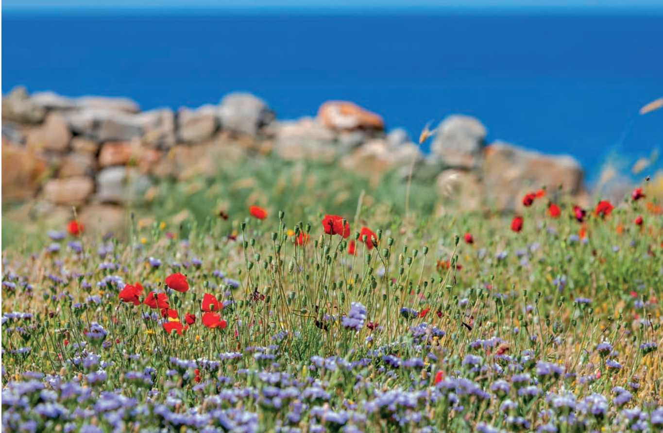
Wild poppies in the mountains of Crete