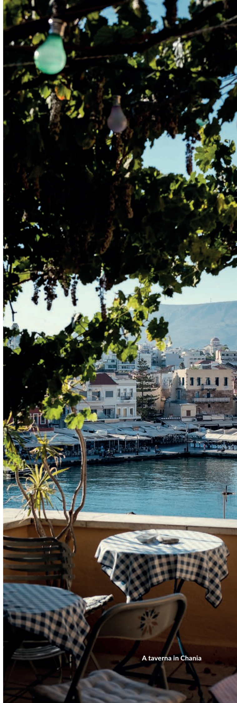
A taverna in Chania

*NB: there can be no guarantee about precise flowering times. All itineraries are subject to change according to local conditions.