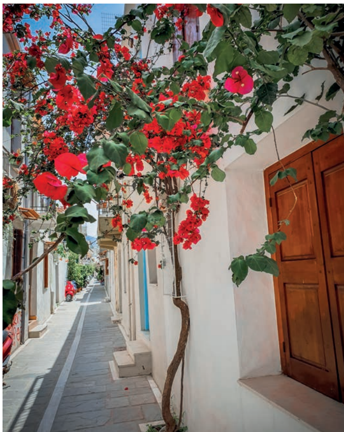
In the botanical garden (top); Blue vistas of Crete; A flower-filled street in Chania (above)