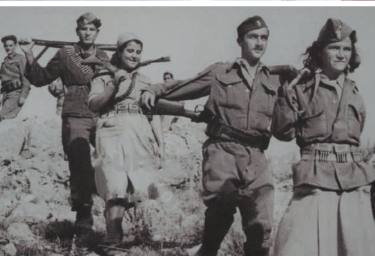
Wildflowers in full bloom (top); Sample the wines of Crete; Frescoes at Knossos Palace; The local resistance during the Battle of Crete (above)

The cost of the tour sharing a room is €2,112