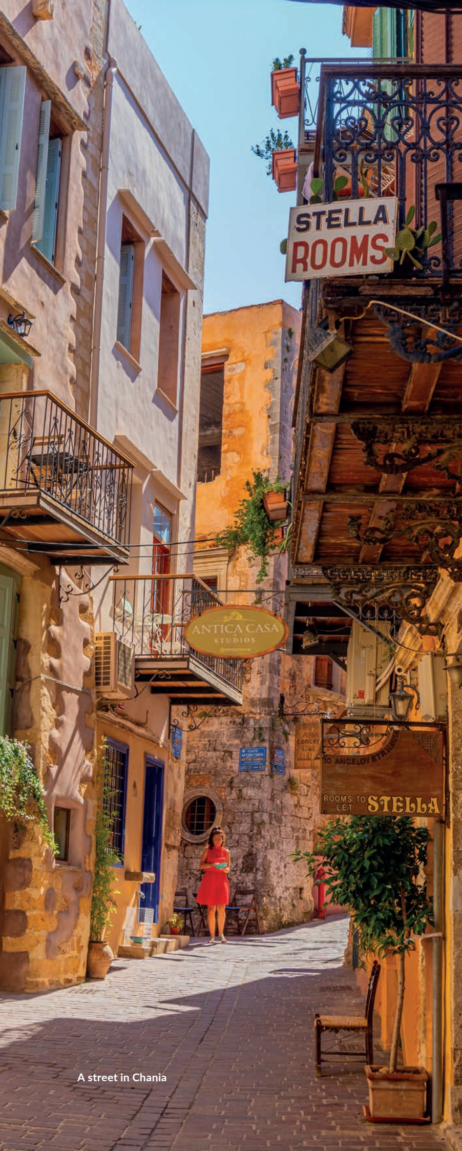
A street in Chania

Visiting Crete is a sensory adventure filled with the scents of rosemary, thyme, sage, lavender, and chamomile. An island brimming with beautiful flowers and stunning landscapes, there are around 2,000 species of plants, of which about 10% are endemic to Crete. The peak explosion of wildflowers occurs from March to May, when wild orchids and tulips are joined by chamomile, poppies, anemones, iris, field gladiolus, and much more, in bloom.