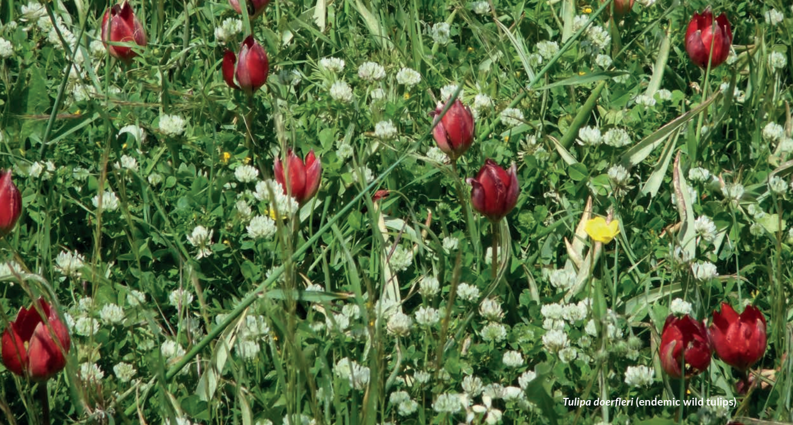
Tulipa doerfleri (endemic wild tulips)