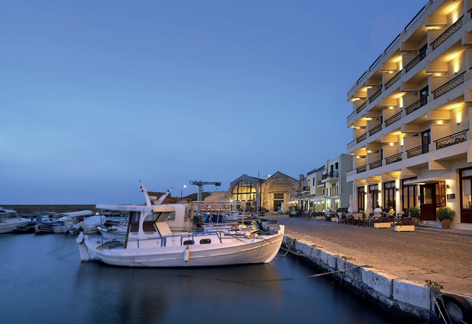
The Hotel Porto Veneziano