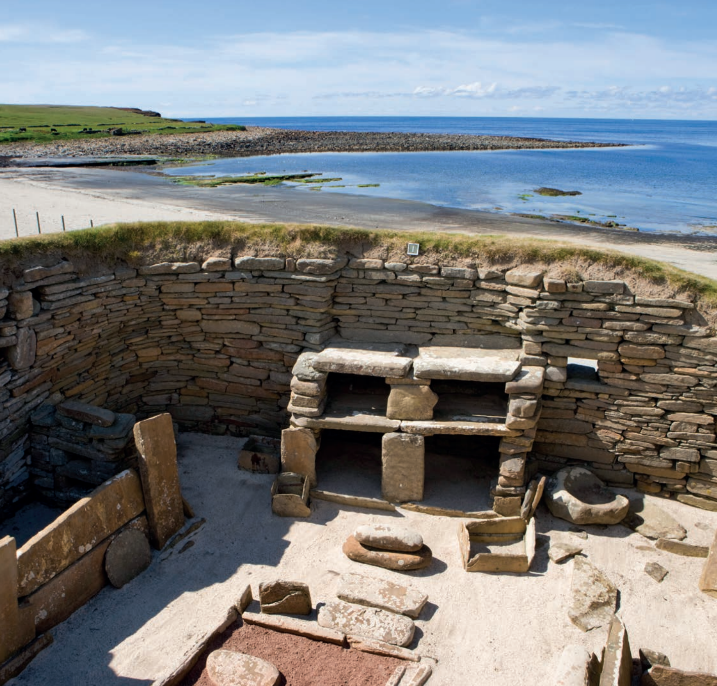
Skara Brae, Orkney

Travel to the northernmost reaches of the UK through spectacular landscapes. Discover history that encompasses Neolithic times, the Bronze and Iron Ages, the Picts and the Vikings, and continues into the modern day. This tour takes you to two of the farthest Scottish Isles, both dramatically beautiful and rich in history and culture, allowing you to experience both Shetland and Orkney in just over a week.