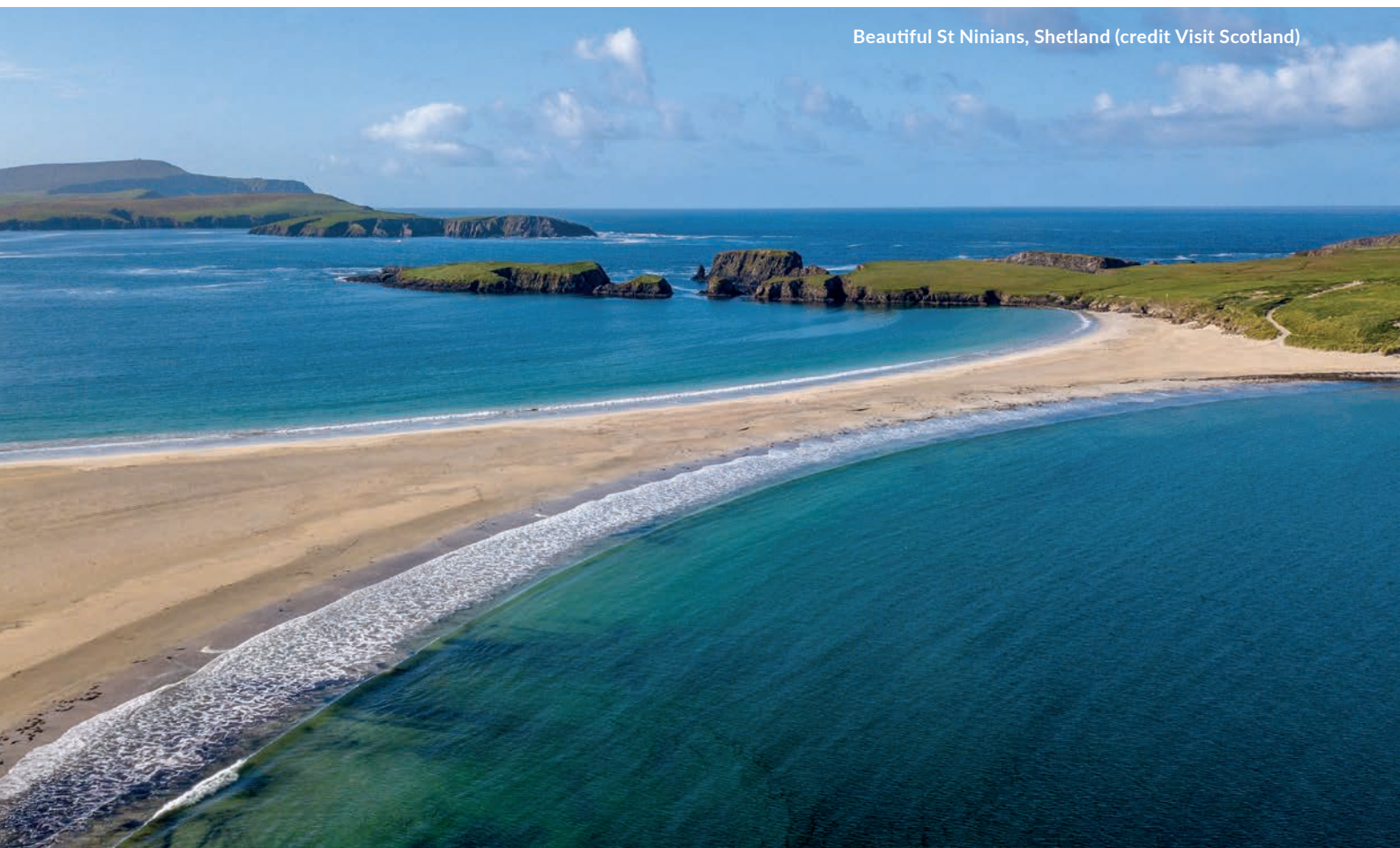
Beautiful St Ninians, Shetland

and intensive care, later holding senior hospital roles across surgery, medicine, outpatients, and pre-operative assessment. She also gained qualifications in management and advanced clinical practice. Her nursing work across almost every inhabited island in Shetland (except Papa Stour) has given her a rare, first-hand insight into island life. She featured in the BBC series Island Medics , highlighting her unique role in the community.