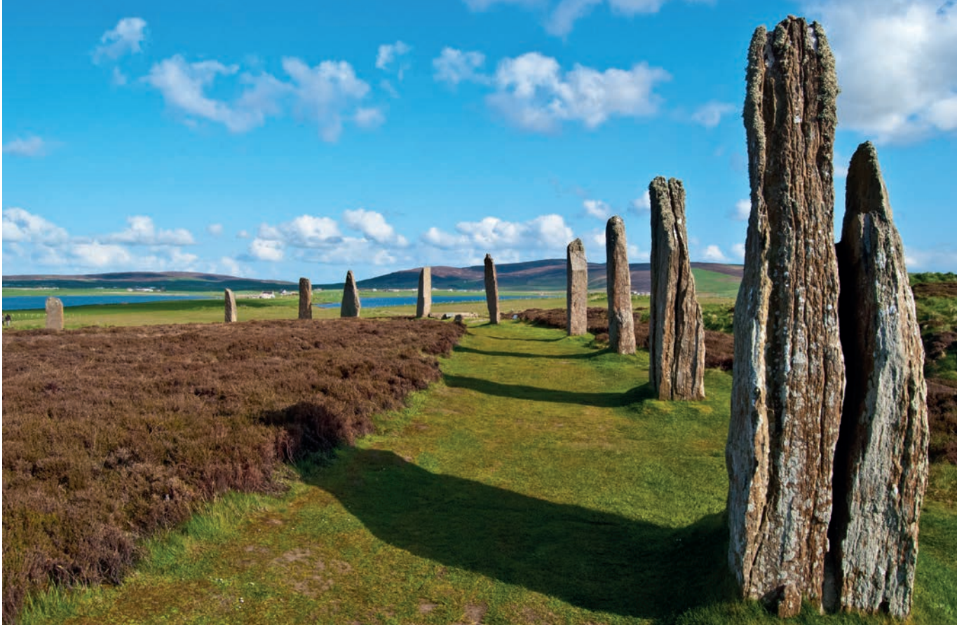
The Ring of Brodgar, Orkney