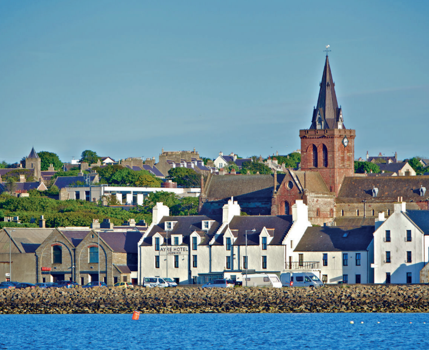
Orkney Ayre Hotel