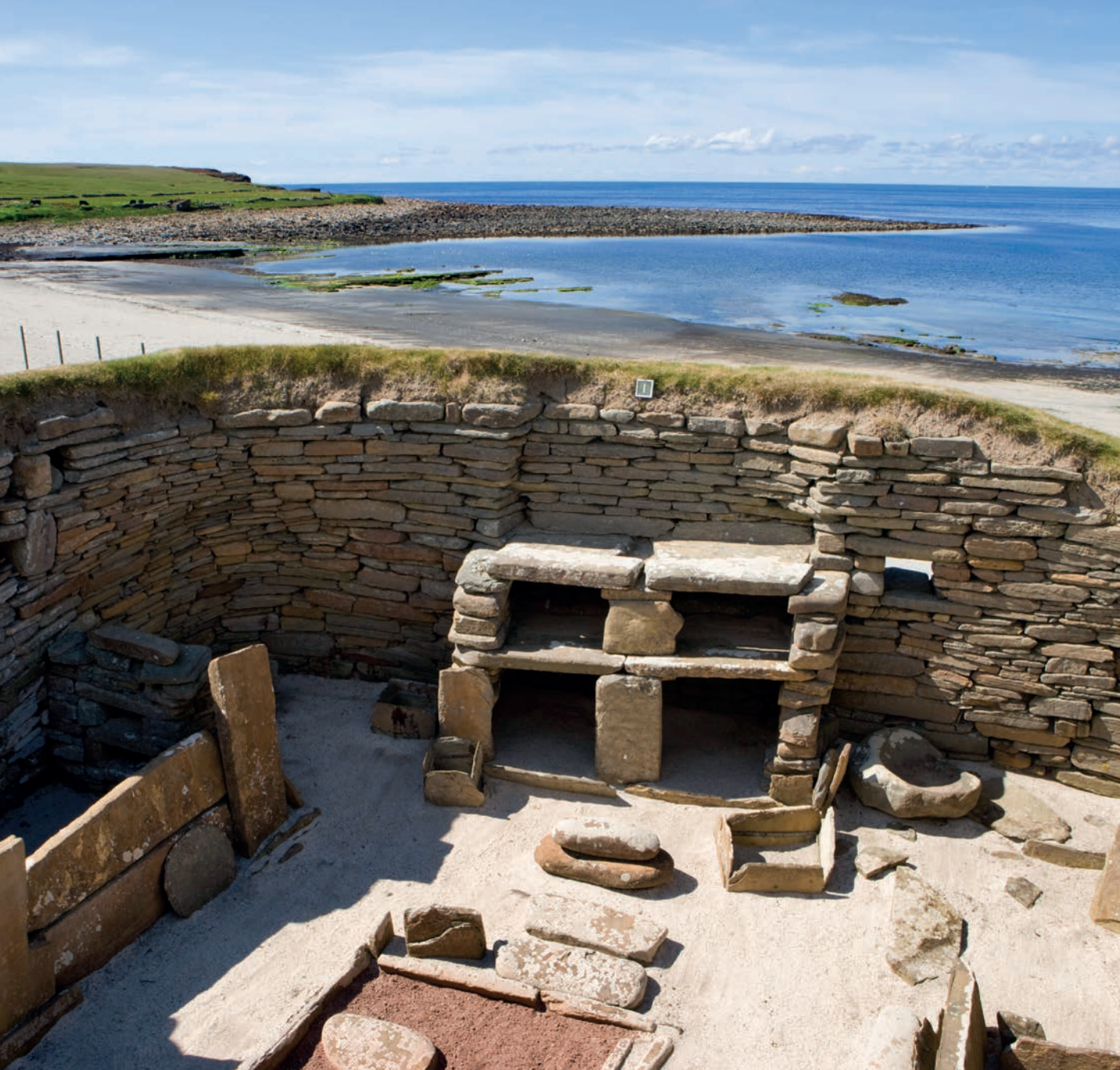
Skara Brae, Orkney

Travel to the northernmost reaches of the UK through spectacular landscapes. Discover history that encompasses Neolithic times, the Bronze and Iron Ages, the Picts and the Vikings, and continues into the modern day. This tour takes you to two of the farthest Scottish Isles, both dramatically beautiful and rich in history and culture, allowing you to experience both Shetland and Orkney in just over a week.