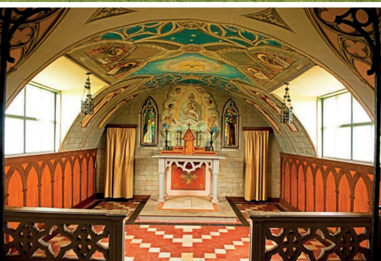
Lodberries in Lerwick, Shetland (top); Monument to the Shetland Bus; Skail House, Orkney (credit Visit Scotland); The Italian Chapel (credit Visit Scotland) (above)