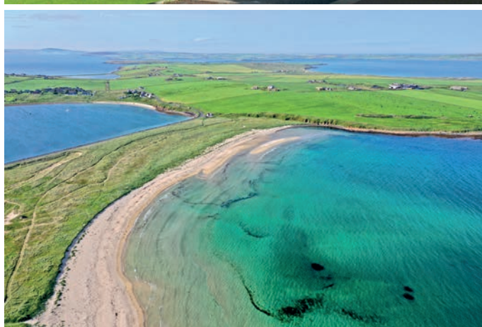
Shetland ponies (top); Jarshof, Shetland ; Earl's Palace, Orkney ; The Churchill Barriers, Orkney (above)