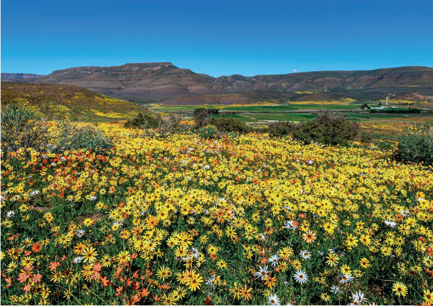
Namaqualand daisies in full bloom