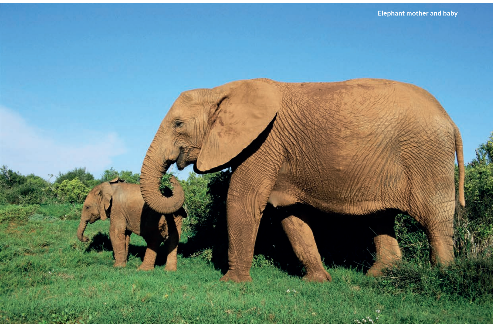
Elephant mother and baby