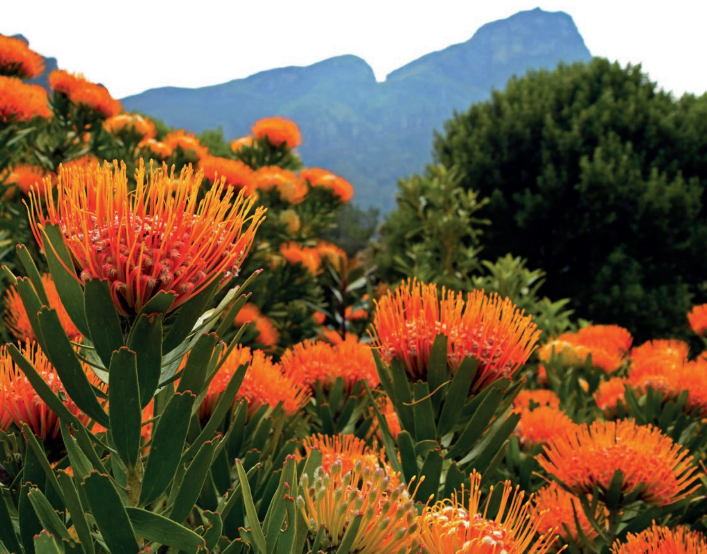
Pincushion proteas in Kirstenbosch Botanical Garden with Table Mountain behind

The Cape Floral Kingdom is one of the richest areas of plant biodiversity in the world. This tiny region on the southern tip of South Africa has been identified as one of the world's 35 biodiversity hotspots. One of only six Floral Kingdoms in the world – and the only one contained within a single country – it is by far the smallest and relatively the most diverse. One of the outstanding botanical stars of the show is the beautiful and distinctive Fynbos vegetation, unique to the Cape Floral Region, which includes the famous protea.