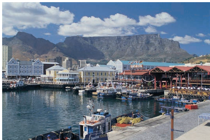
Watsonia tabularis, unique Cape Fynbos species growing on the top of Table Mountain (top); White rhinos; Cape Town and Table Mountain (above)