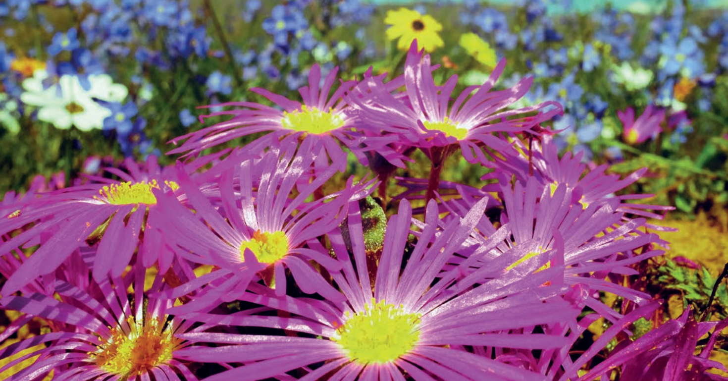
A close-up of the famous Namaqualand wildflowers

surroundings and unique wildflower displays. This is the only place on earth where rooibos ( Aspalathus linearis ), a unique health-enhancing plant, is found. Visit a local rooibos farm at Skimmelberg and see how both rooibos and buchu are cultivated organically and take in the spectacular wildflowers when in season.