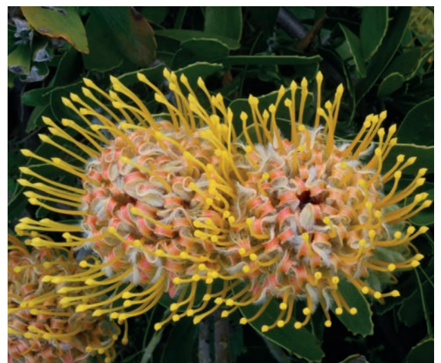
A yellow protea

Much of this diversity is associated with the fynbos biome, a Mediterranean-type, fire-prone shrubland, of which the national flower, the king protea, is a member. The Cape Floral Region has enormous economic and intrinsic biological value as a biodiversity hotspot.