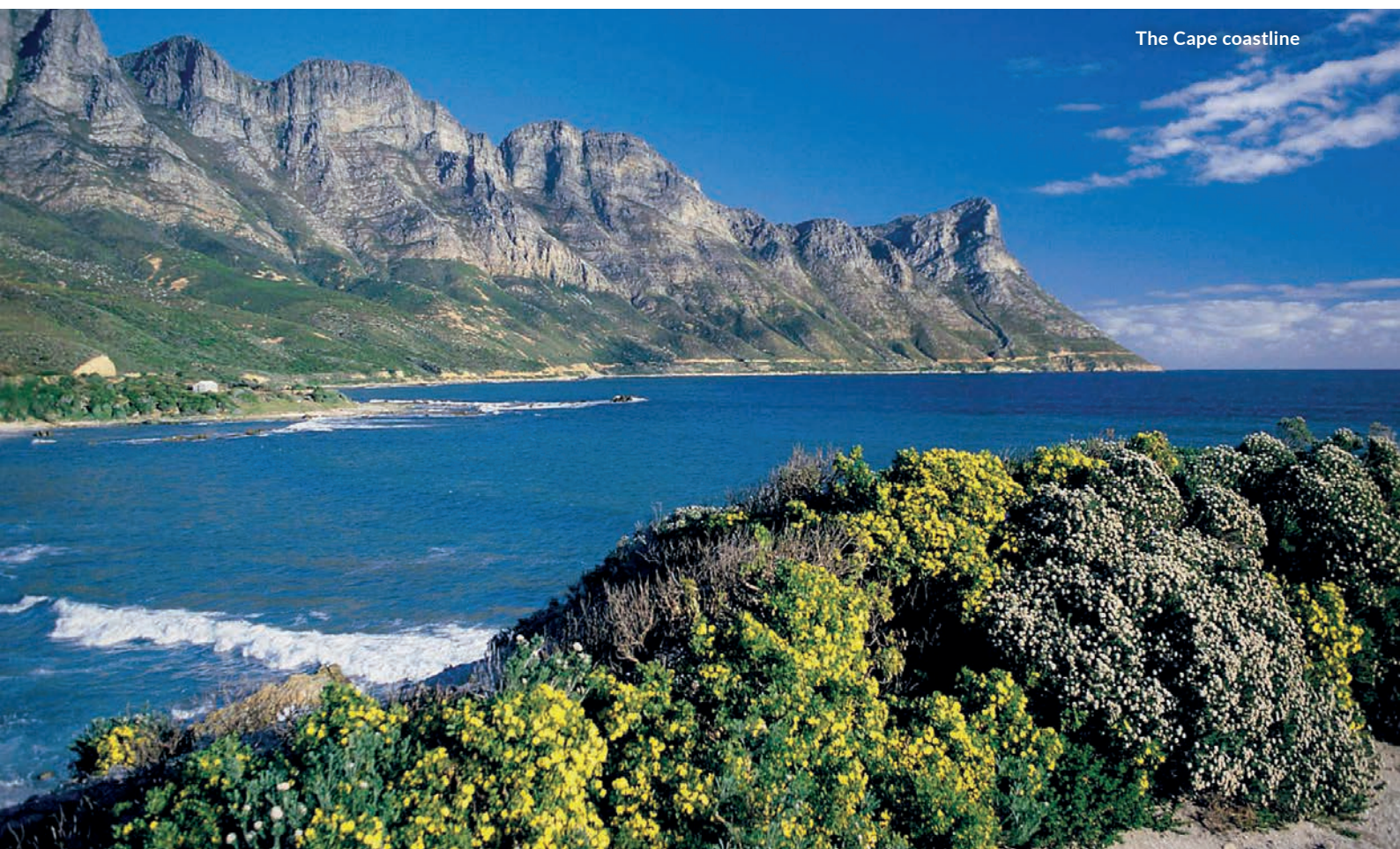
The Cape coastline

Lorraine Casey – Wildflowers, Wine and History in the Canary Islands , April 2025