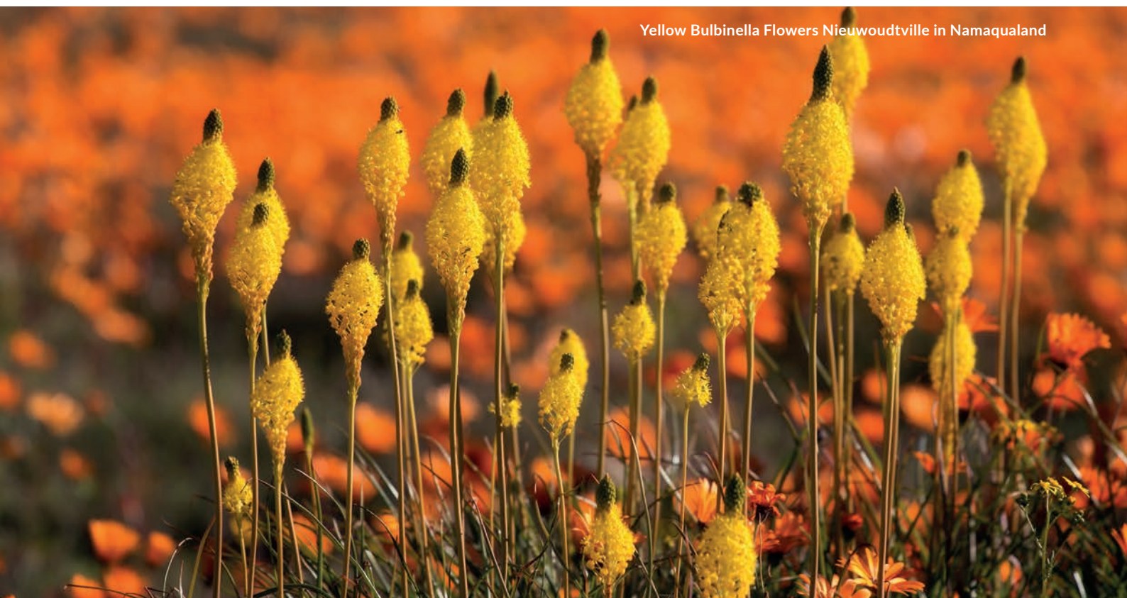
Yellow Bulbinella Flowers Nieuwoudtville in Namaqualand

Am: Continue towards the Cederberg Mountains and take in spectacular