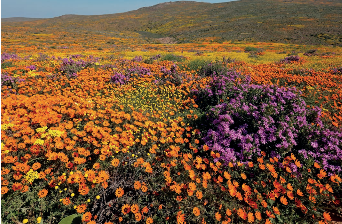
Colourful Cape wildflowers, Namaqualand, South Africa