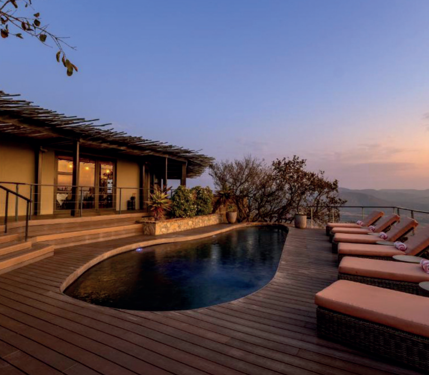
Zulu Rock Lodge, Bababango Game Reserve