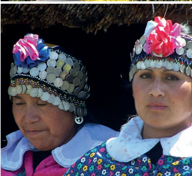
Valle de la Luna – the extraordinary Valley of the Moon, Atacama b(top); San Francisco Church, Castro, Chiloe Island; Mapuche women (above)

The cost of the tour sharing is USD $6,552 per person