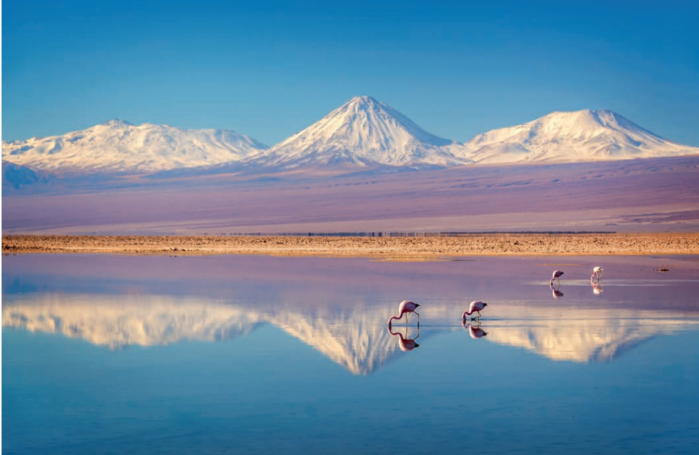
Flamingoes on Laguna Chaxa in the spectacular Atacama Desert, Chile