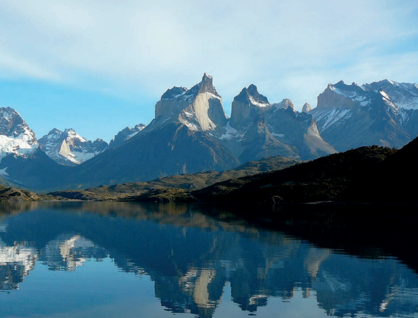
Magnificent Torres del Paine, Patagonia, with the famous 'Horns' visible

Chile is a land of extraordinary beauty and contrast, snaking down from the driest desert in the world to vast frozen glaciers in the south, passing volcanoes, lakes and lush vineyards.