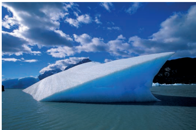
The huge Tatio geysers in Atacama Desert (top); Petrohue River with; Osorno Volcano behind; Brightly painted palafitos on Chiloe Island; A glacier in the Grey Lake (above)