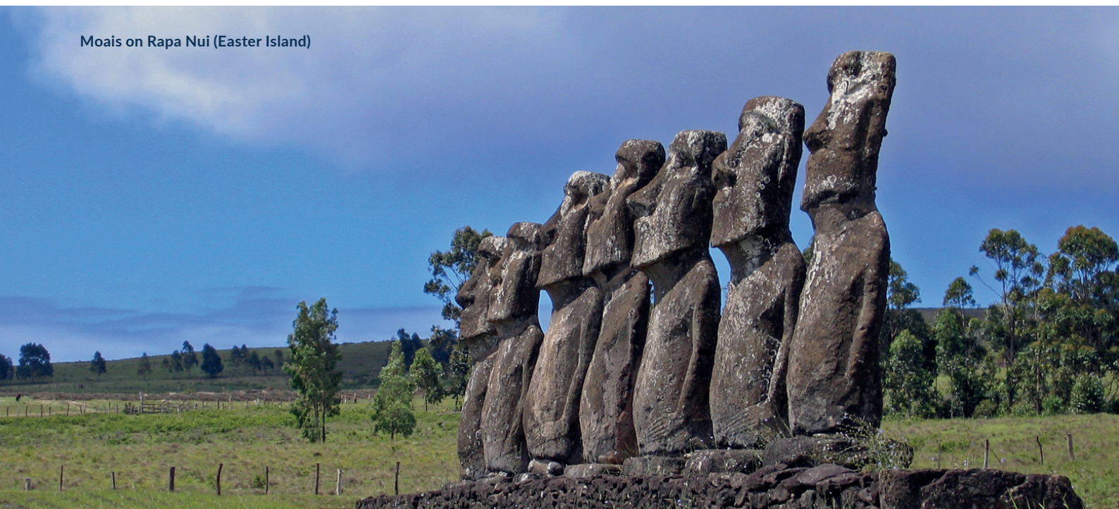
Moais on Rapa Nui (Easter Island)

NB: All itineraries are subject to change according to local conditions.