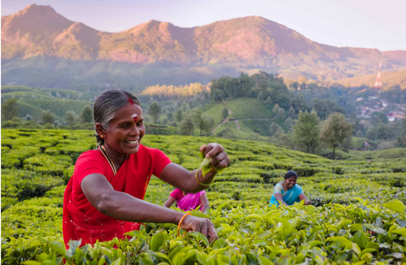
Tamil women collecting tea leaves in Southern India, Kerala