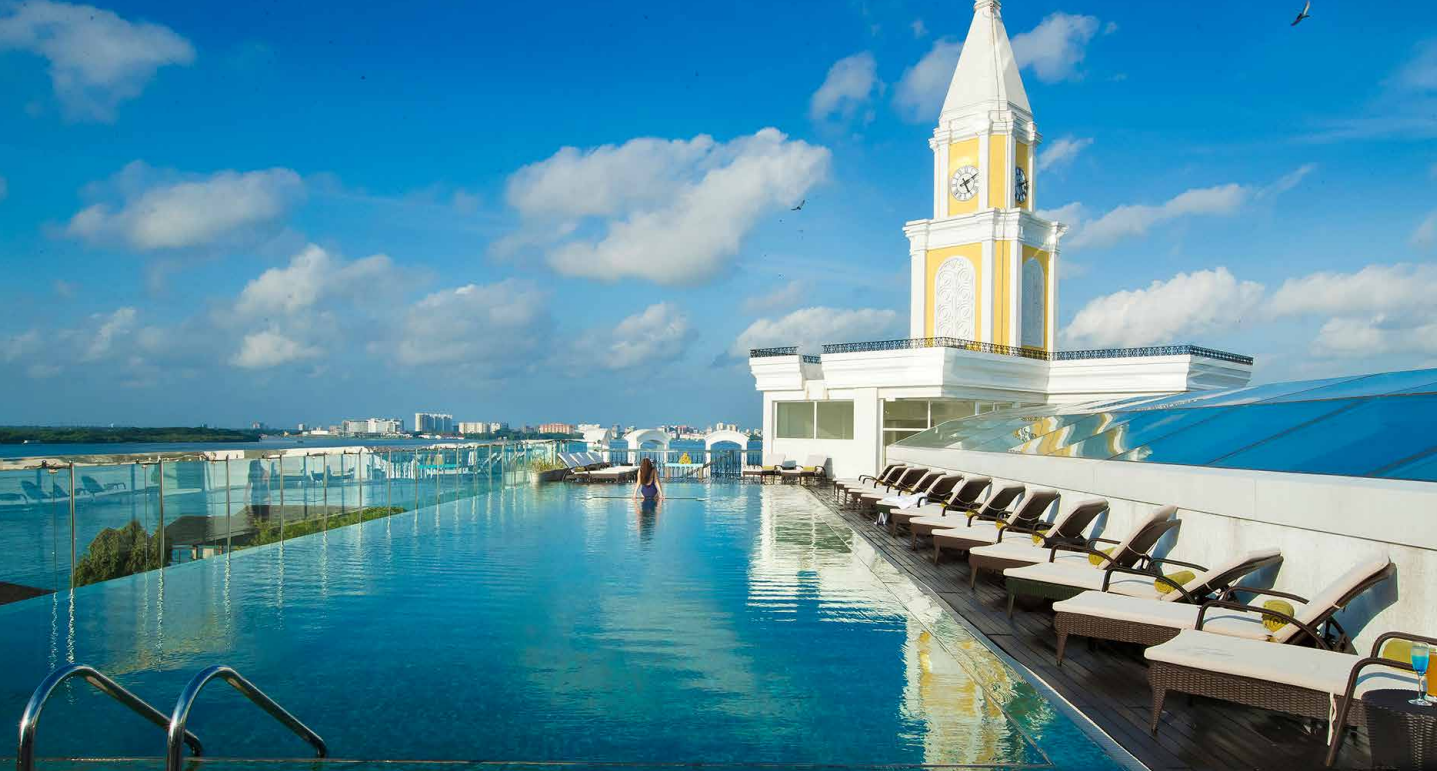
Fragrant Nature Hotel