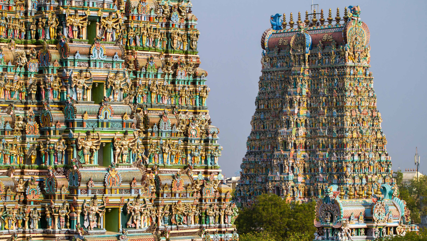
Meenakshi Temple in Madurai

The captivating Malabar Coast has been a meeting place of cultures throughout history. Its lush landscapes were fragrant with the precious spices that brought traders from far and wide, making this coastline rich in both wealth and culture. This tour takes you through the most evocative parts of Malabar, taking inspiration from Hortus Malabaricus (meaning “Garden of Malabar”).