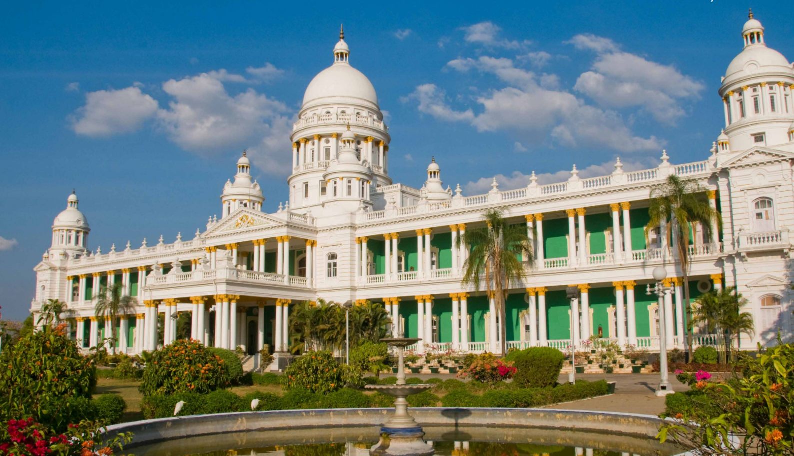
Lalitha Mahal Palace in Mysore