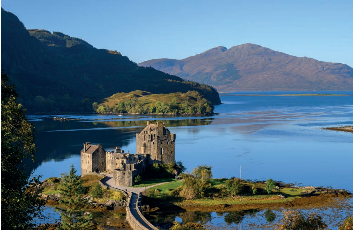
Eilean Donan Castle