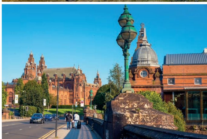
Drive through the magnificent Trossachs (top); Culloden Battlefield; The Old Man of Storr, Skye; Glasgow (above)