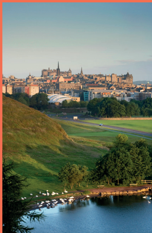
Edinburgh from Holyrood Park