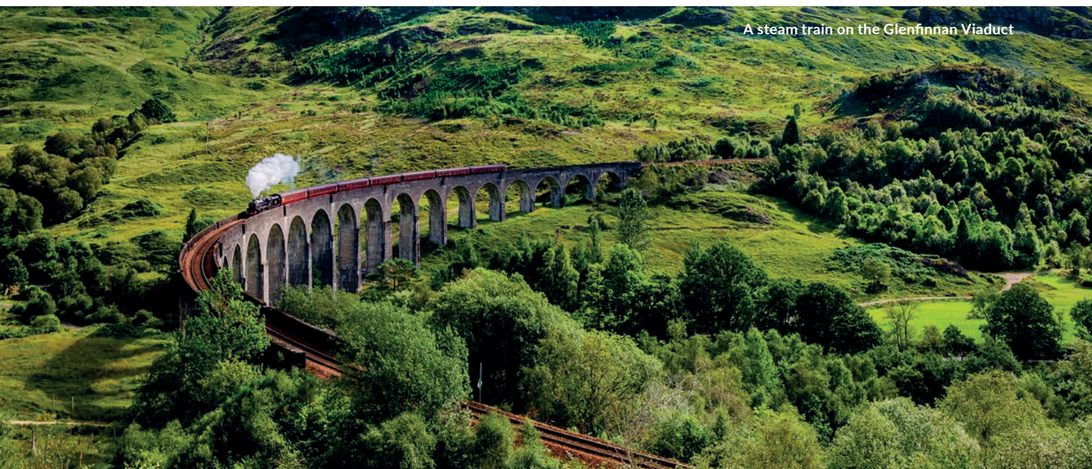
A steam train on the Glenfinnan Viaduct