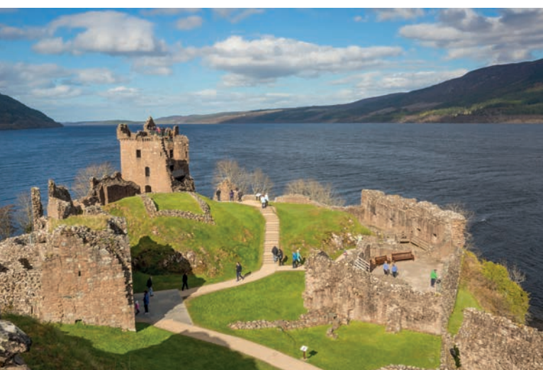
Elegant Edinburgh at sunrise (top); Attadale House; The Royal College of Surgeons Edinburgh; The ruins of Urquhart Castle (above)

The cost of the tour is $8,686 per person sharing