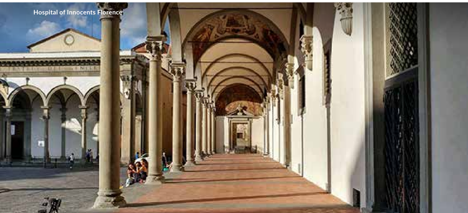
Hospital of Innocents Florence

All itineraries are subject to change according to local conditions.