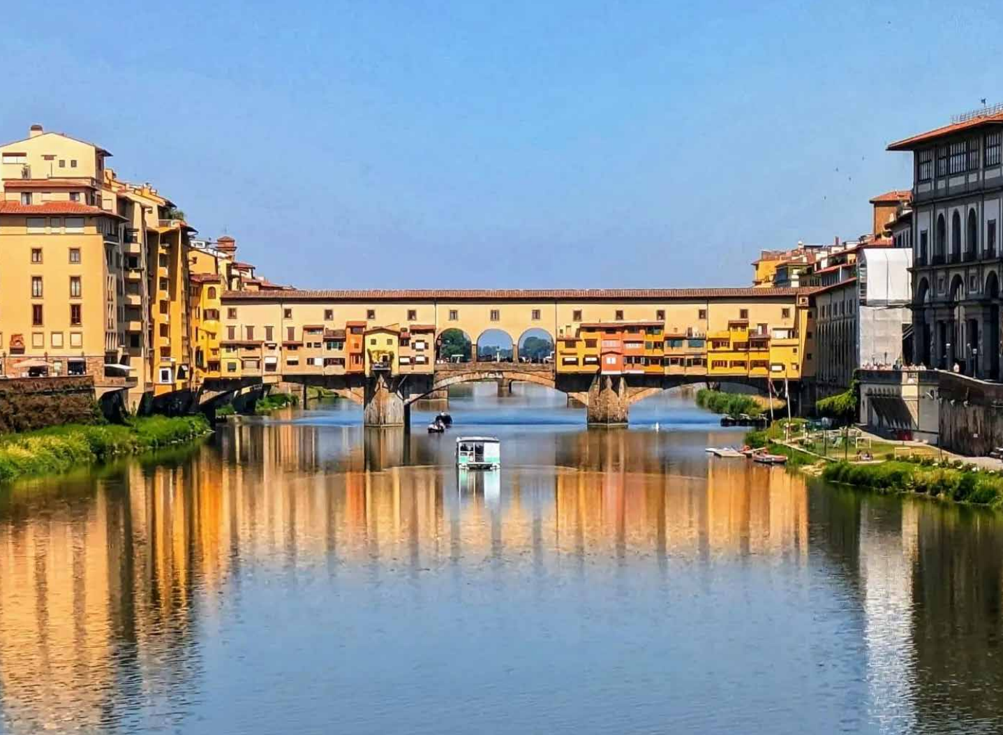
Ponte Vecchio, Florence

Celebrate the legacy of Florence Nightingale with a journey to her birthplace – the historic city that shares her name. Trace the evolution of Florence, from its Roman roots through medieval alleys to the Renaissance grandeur of Piazza della Signoria. Admire the iconic Duomo and visit the Basilica di Santa Croce, where Galileo is buried.