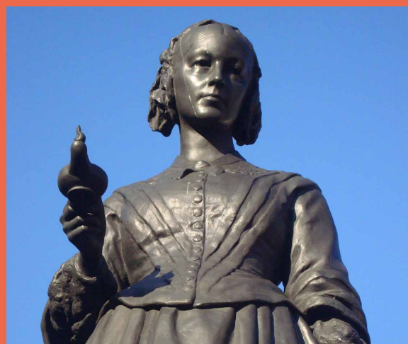
Florence Nightingale statue

Extension cost with a room to yourself is AUD $948