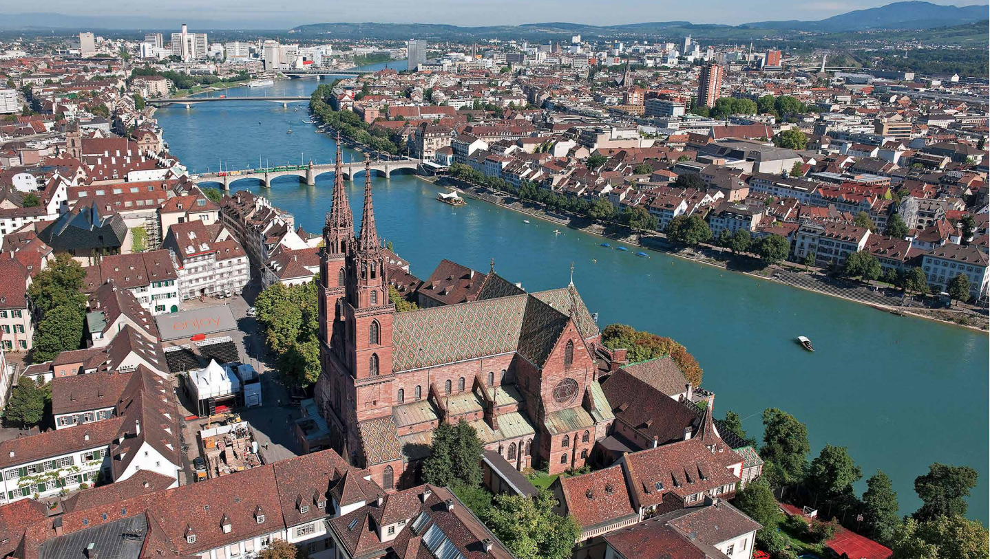
River and Minster view, Basel