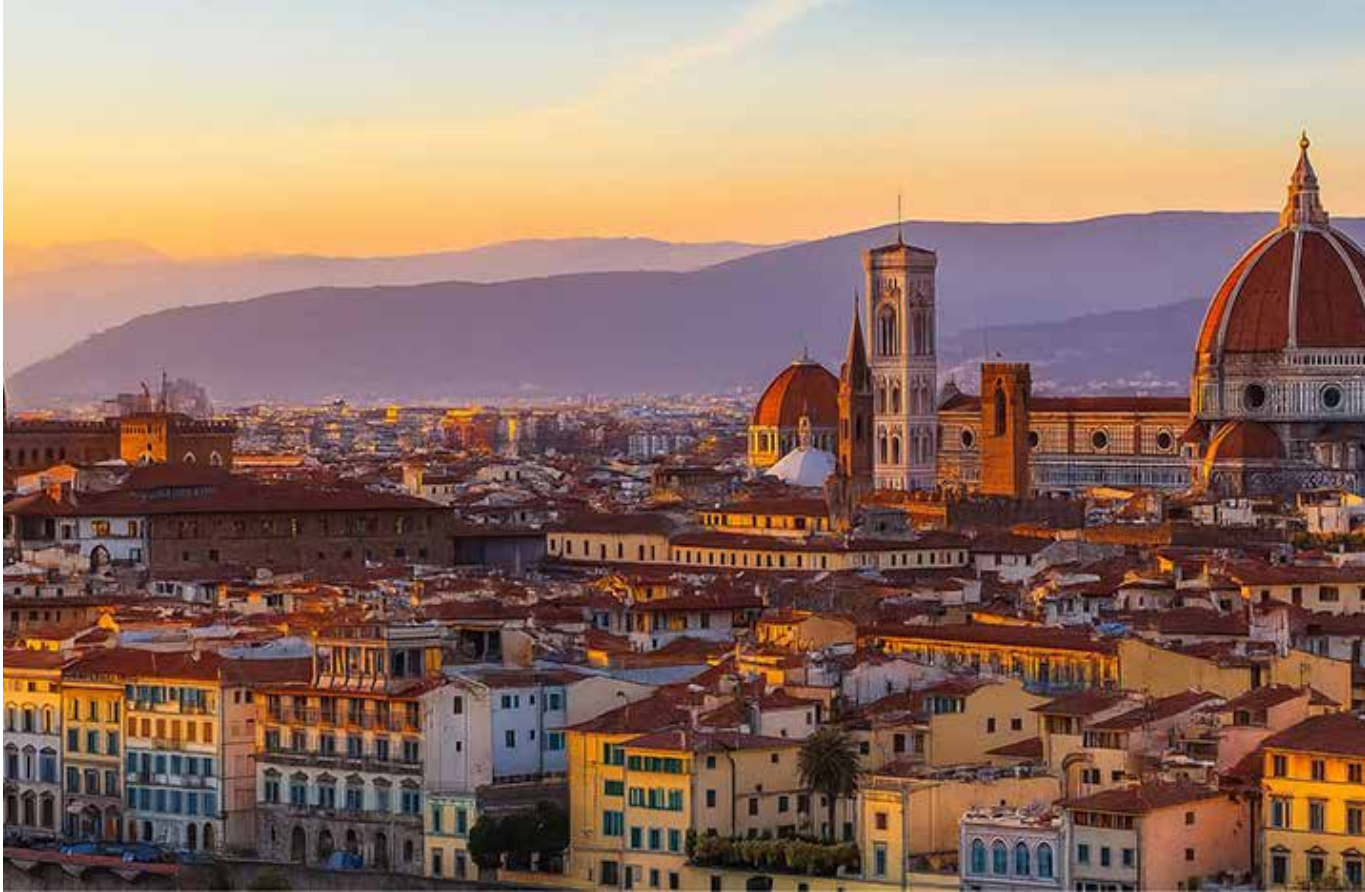
Florence as the sun sets