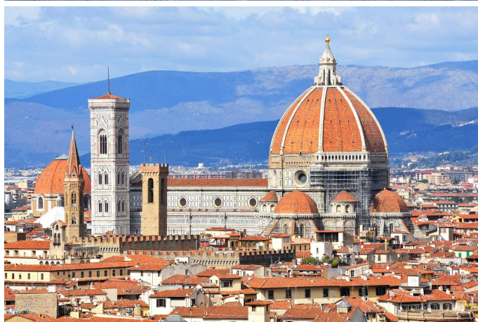
Fountain of Neptune, Piazza della Signoria (top); A wine window, Florence; Santa Maria Duomo, Florence (above)