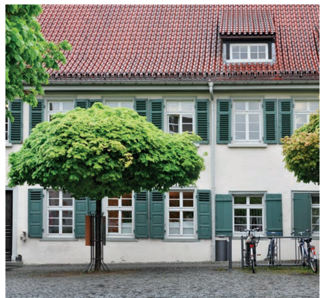
An old building with wooden windows and shutters

All itineraries are subject to change according to the local conditions.