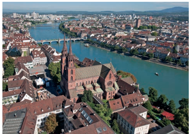
River and Minster view, Basel

This historic hotel was previously the Kaiserswerth Sisterhood and Deaconess Institution, where Florence Nightingale trained. Between 2000 and 2002 the old motherhouse was converted into a hotel, today's Hotel Mutterhaus Düsseldorf. Ideally located on the institute's beautiful leafy grounds, rooms are spacious, bright and comfortable, and breakfast is buffet style.