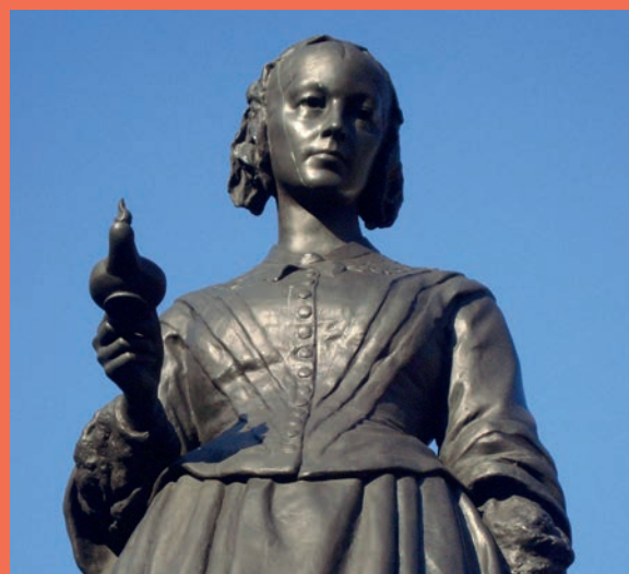
Florence Nightingale statue

Extension cost with a room to yourself is €550