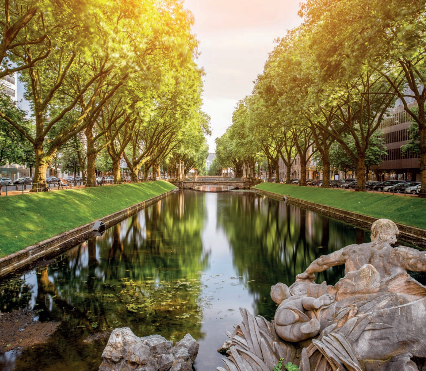
Water canal in Düsseldorf city

Florence Nightingale believed that nursing was an art, and this tour offers a great opportunity to explore Kaiserswerth, the quaint northern neighbourhood where she honed her craft and which remained important to her throughout her career. Spend a day touring the Kaiserswerth Diakonie site. Stay in the historic Mutterhaus Hotel, previously the Kaiserswerth Sisterhood and Deaconess Institution, where Florence received medical training from the institute's founder, Pastor Theodor Fliednerat.