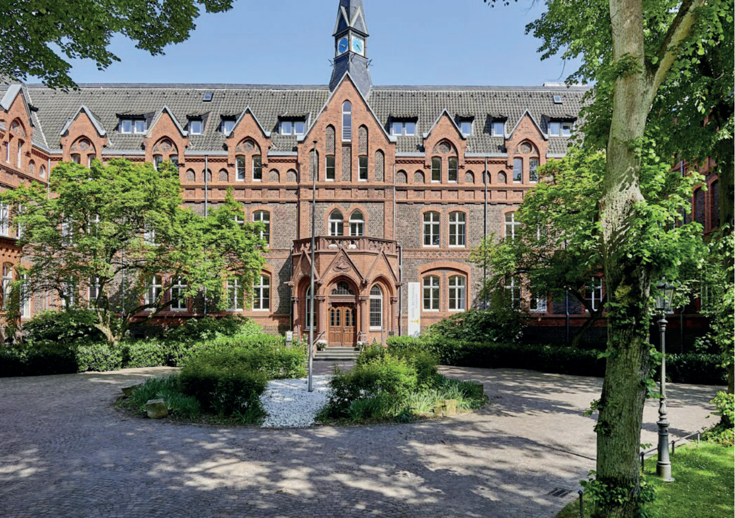
Hotel Mutterhaus, Kaiserswerther