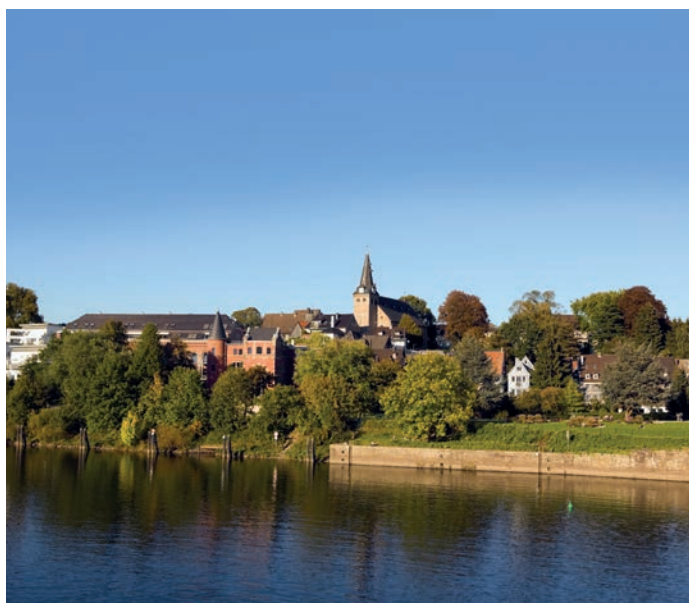
Ruins of the Kaiserpfalz, Kaiserswerth (top); Frank Gehry, Düsseldorf; Banks of the Rhine (above)