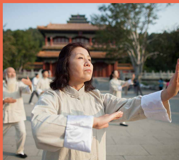
Locals doing tai chi in the Summer Palace, Beijing

Rachel Simpson, previous Physiotherapy and Rehabilitation in China tour