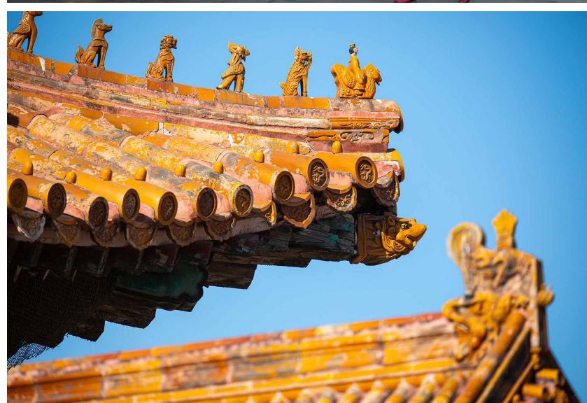
(clockwise from top) The Temple of Heaven; Tai chi with fans; Forbidden City details of imperial architecture; The Forbidden City.