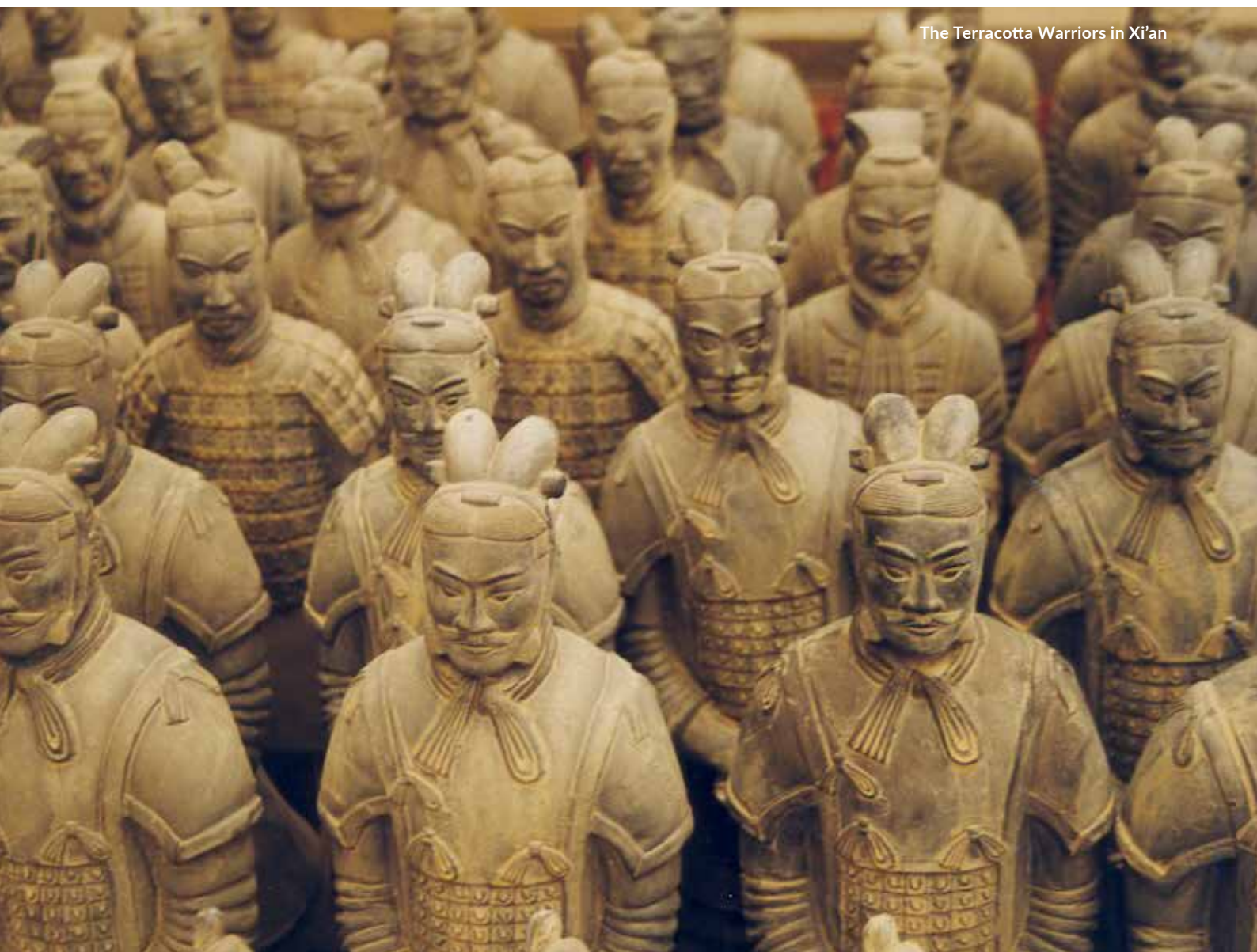
The Terracotta Warriors in Xi'an

All itineraries are subject to change according to local conditions.