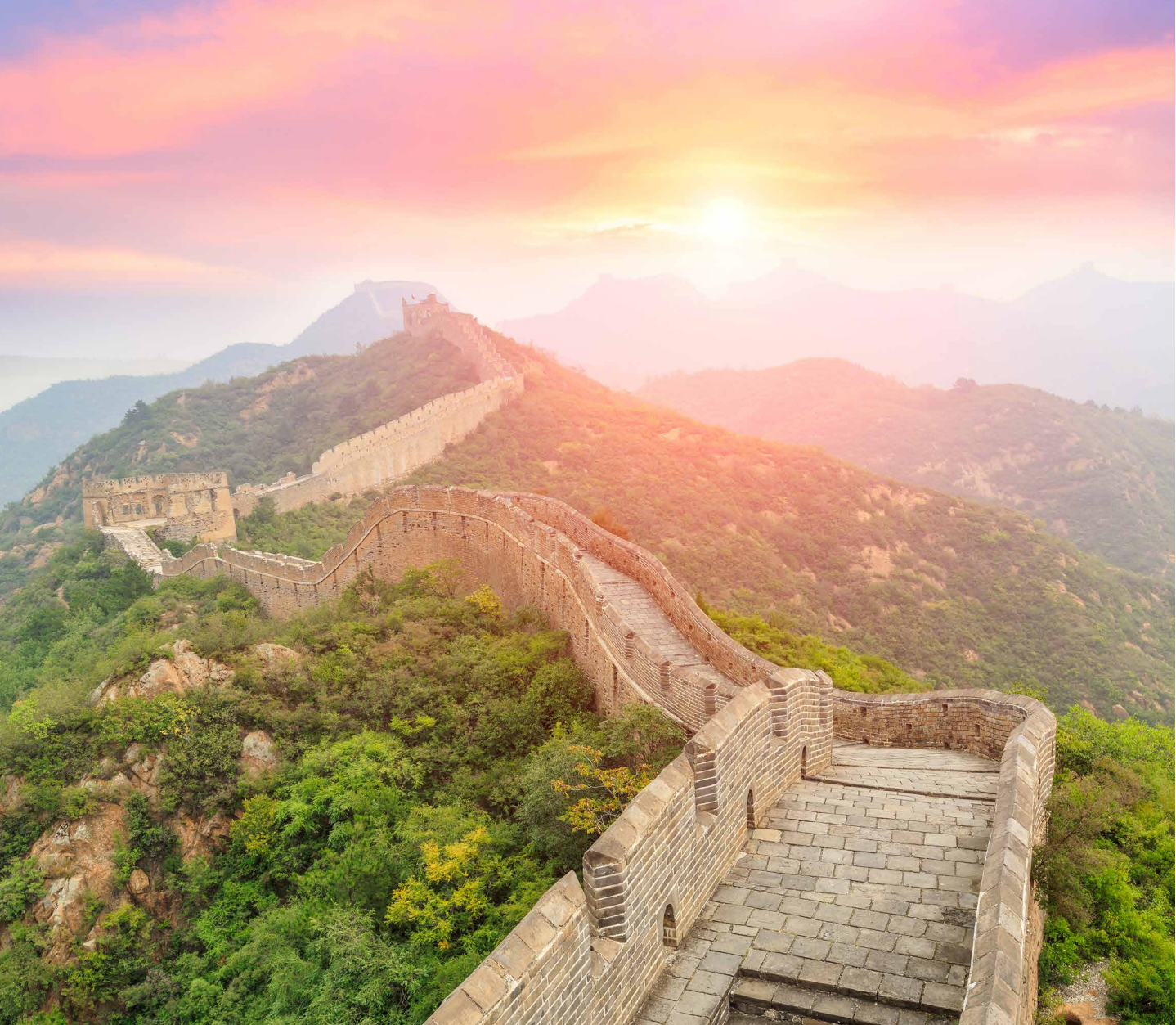
The Great Wall at sunset

This tour is designed to give participants a fascinating insight into China by looking at its history, its culture and its approach to therapy and rehabilitation. A superb cultural programme takes you well off the beaten track to offer an insider's view of China.