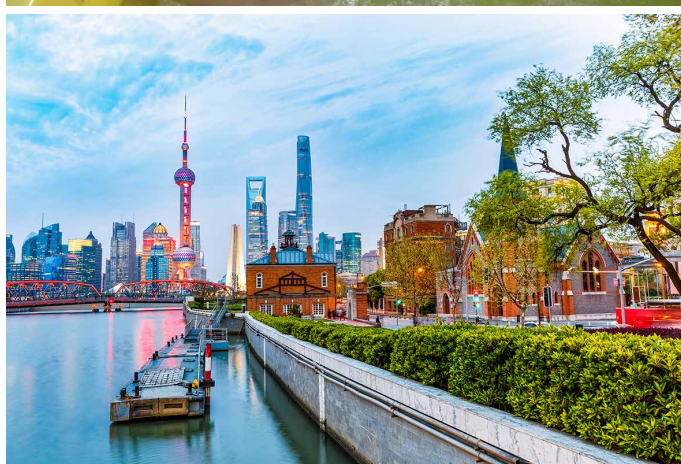
Forbidden City (top); Water therapy in Yangshuo Maternity Hospital; Shanghai skyline (above)