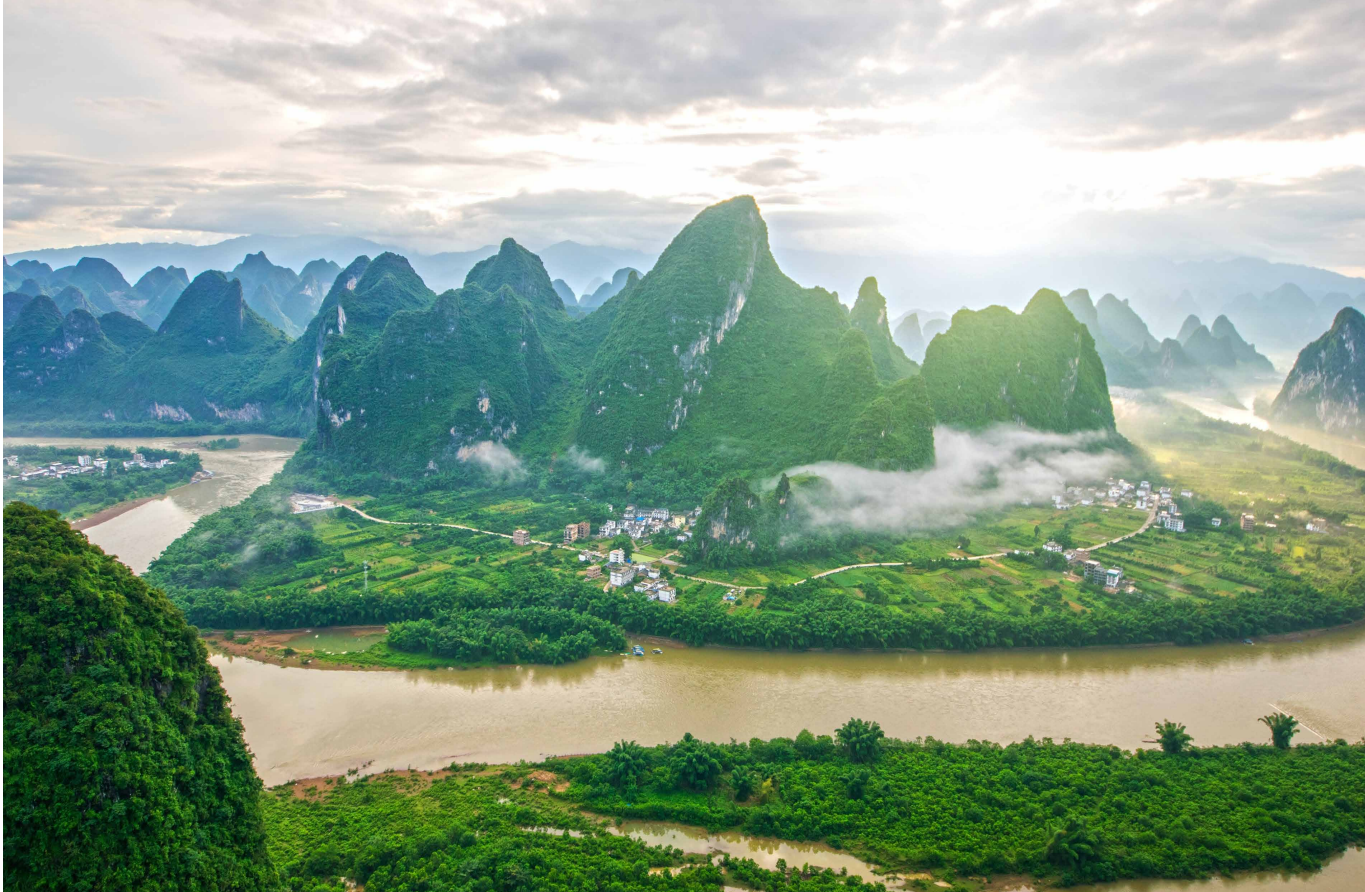
The Li River and mountains of Guilin Province