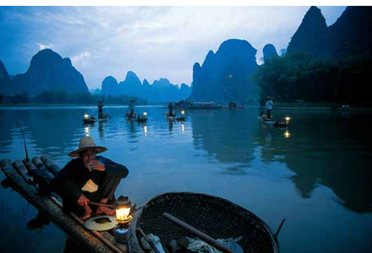
Join the locals in the Muslim Street evening market in Xi'an (top); Close-up of a Terracotta Warrior; Cormorant fisherman on the Li River by night (above)

The cost of the tour is £2,778 per person sharing