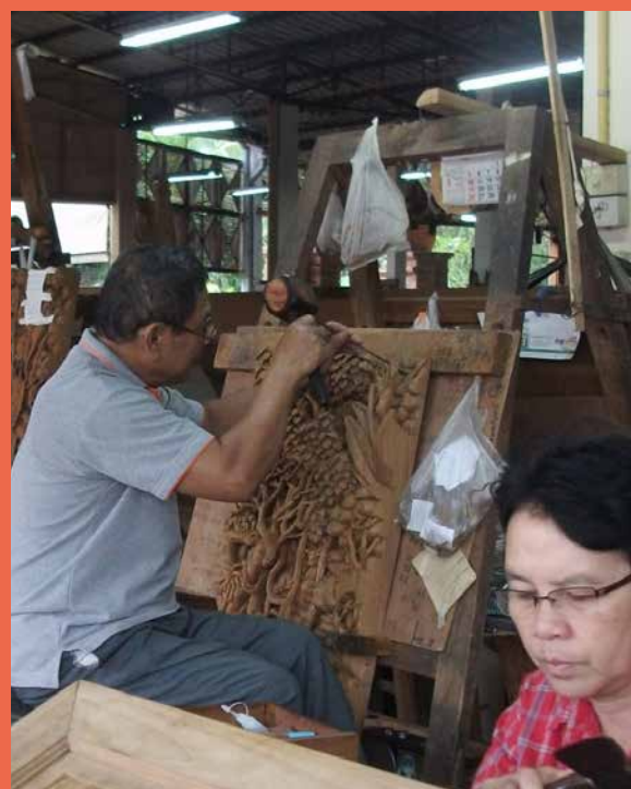
Delicate craftsmanship of the Lanna Thai people