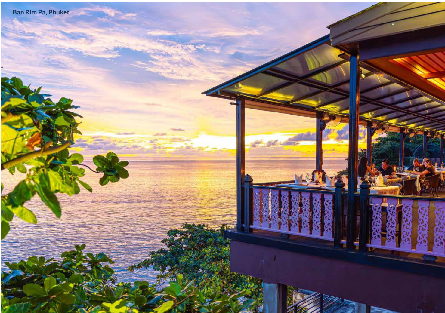
Ban Rim Pa, Phuket