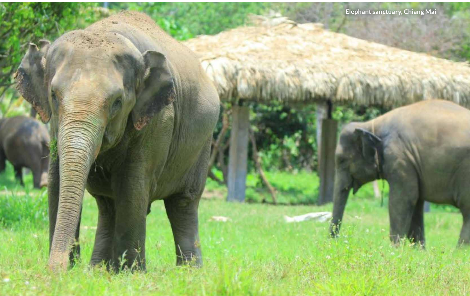
Elephant sanctuary, Chiang Mai

All itineraries are subject to change according to local conditions.