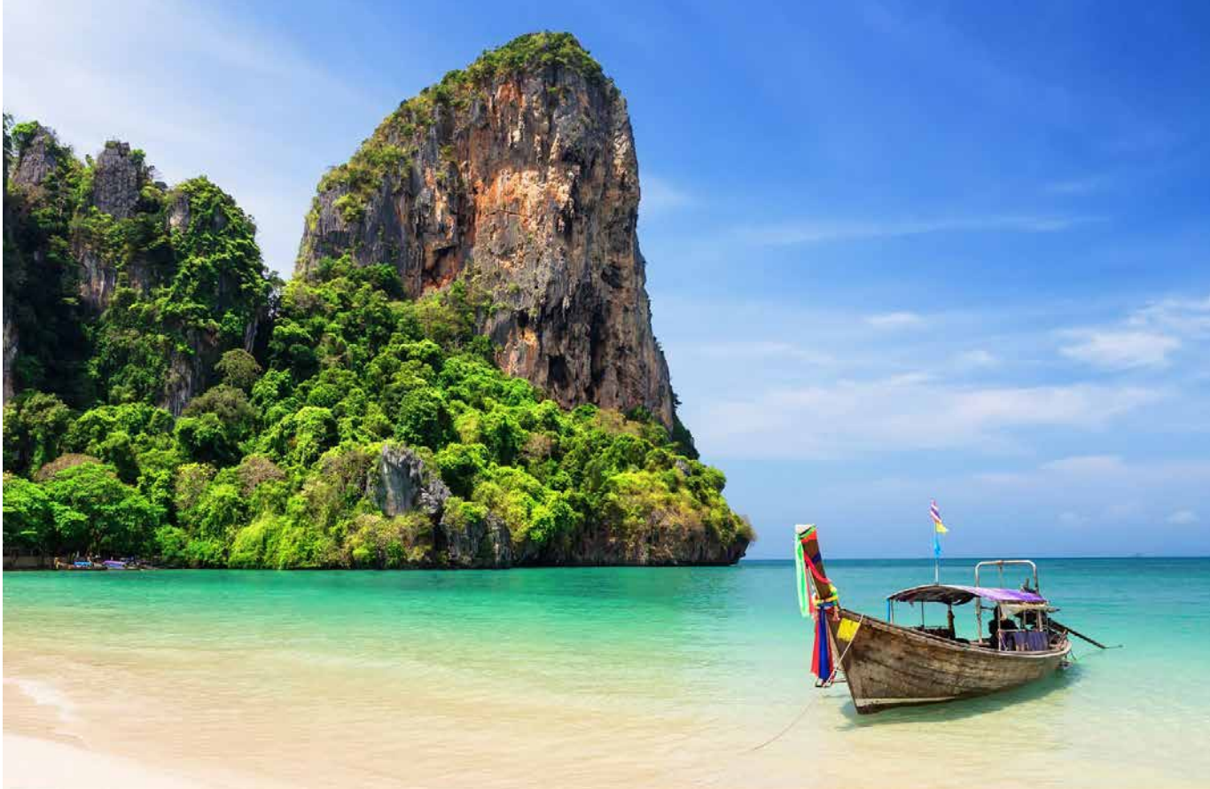
Longtail boat, Phuket