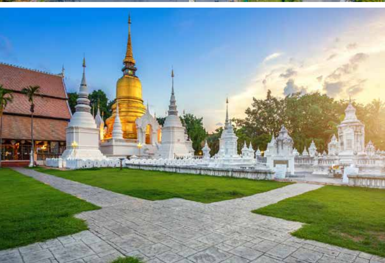
Karon Viewpoint (top); Freshly cooked Northern Thai food; The Big Buddha, Phuket; Suan Dok Temple (above)

The cost of the tour is USD $2,826 per person sharing