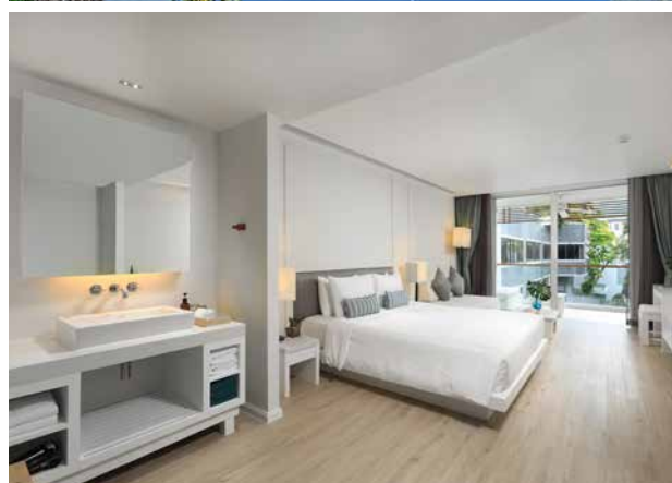
Bodhi Serene Hotel, Chiang Mai (top); Nap Patong Hotel, Phuket (above)

A spacious, contemporary resort just steps from the beach, the location is quiet and peaceful but still within reach of Patong's lively centre. Rooms are generously sized, featuring modern amenities and natural light. The two-level 76Bar Drink & Dine offers a buffet breakfast, a full dining experience, and a lively bar atmosphere. Guests can also enjoy a large outdoor swimming pool and a relaxing spa area.