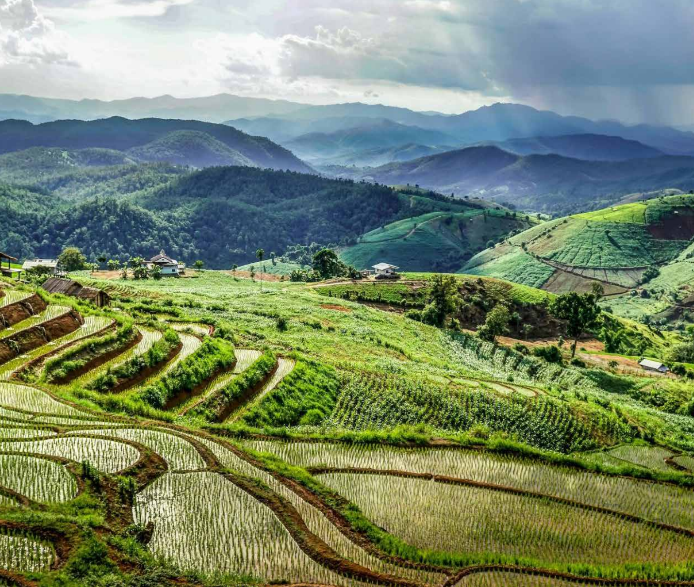
Terraced rice fields, Chiang Mai

This tour offers a fascinating journey through Thailand's history and culture, showcasing how Thai traditions and local practices are integrated into occupational therapy.