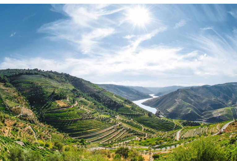
Ribeira (top); The Chapel of Souls (Capela das Almas); The beautiful Douro Valley (above)

The cost of the tour is £940 per person sharing