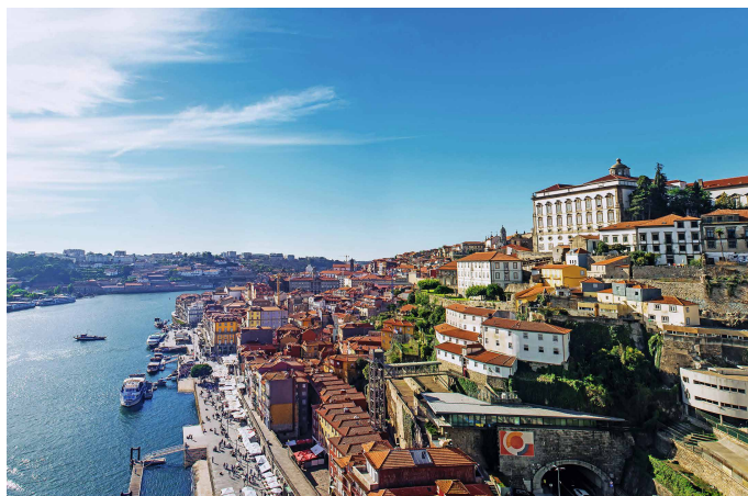
São Bento Train Station (top); Douro Valley; Traditional Rabelo boat; Porto's colourful banks (above)