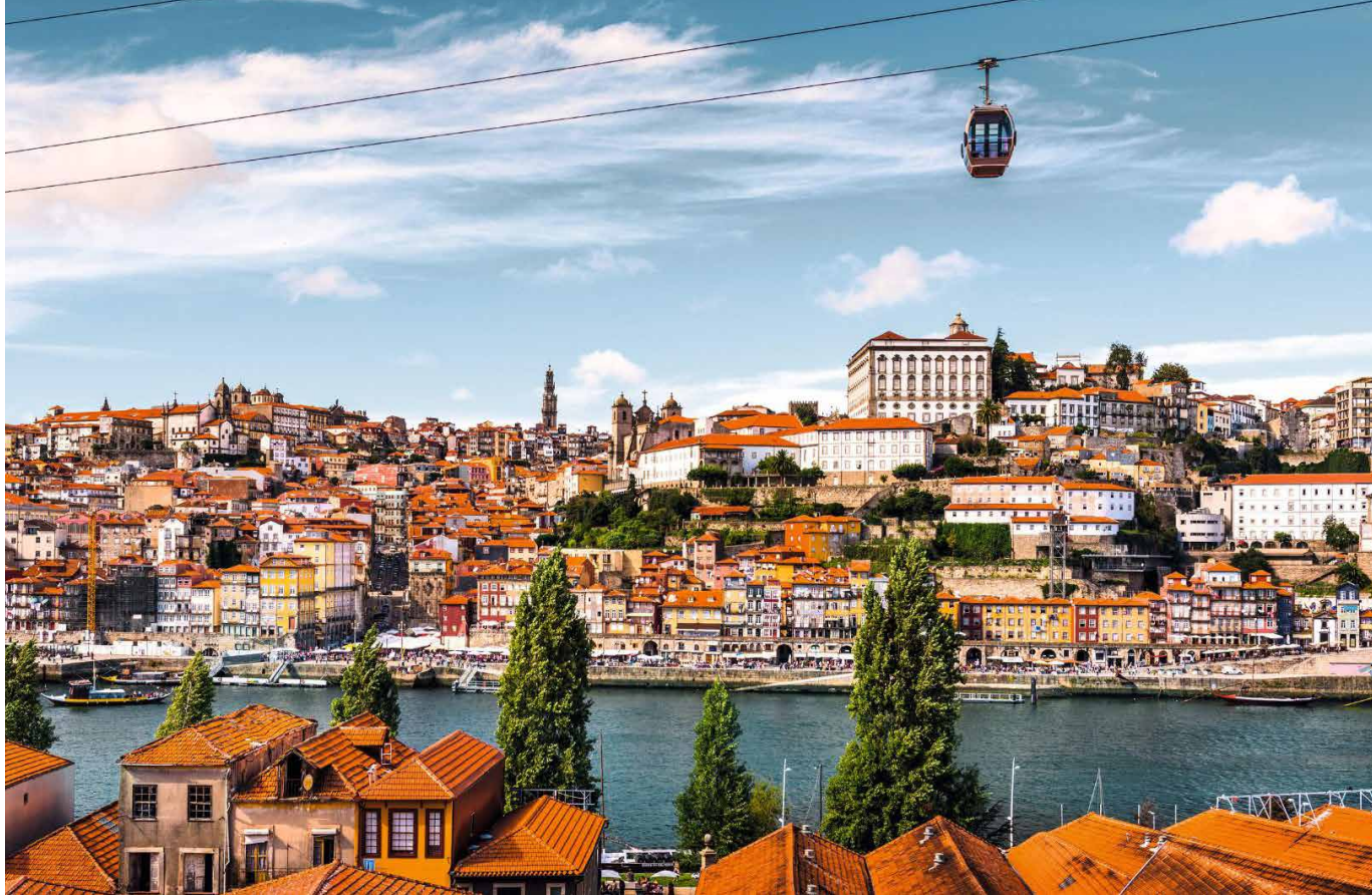
Gaia Cable Car in Vila Nova de Gaia