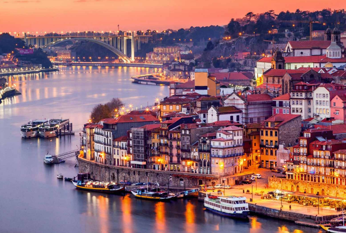
Porto riverfront in the evening