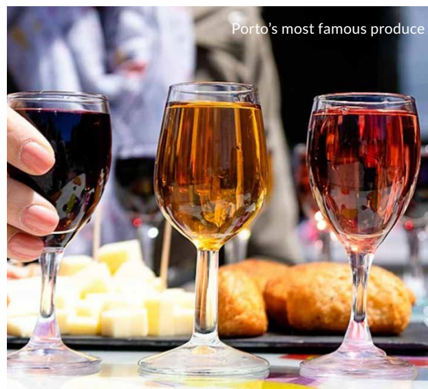
Porto's most famous produce

A modern 4-star country hotel and wine estate perched high on the banks of the Douro in the heart of port wine country. The quinta features tastefully furnished bedrooms, all with air-conditioning, phone and satellite TV. There's also a restaurant, bar and an outdoor pool with spectacular views of the river and beyond.