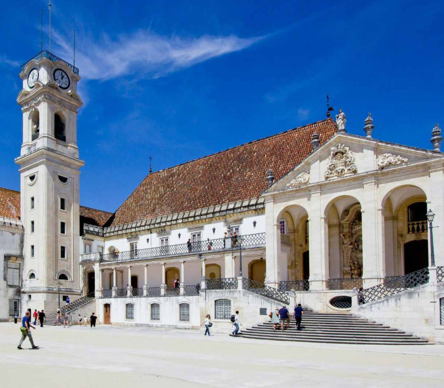
University of Coimbra

Discover Porto's rich history and vibrant culture on a walking tour through the city. Hear the stories told by its stunning 'azulejos' — painted, glazed ceramic tiles that adorn churches, train stations, shops, and homes.