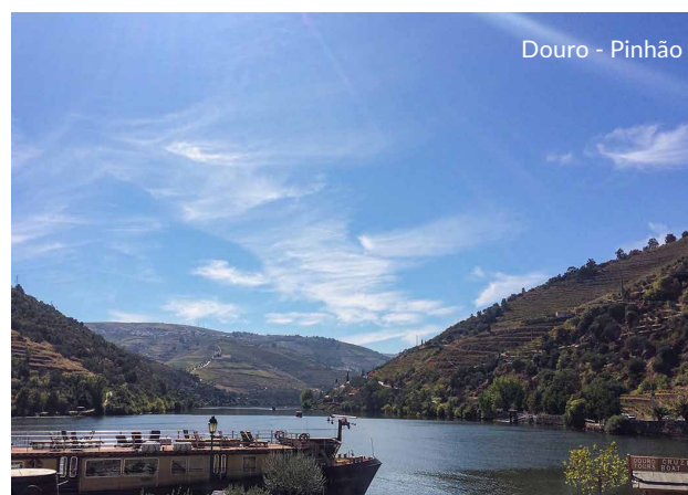
Douro - Pinhão