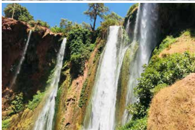
Hassan II Mosque, Casablanca (top); Making traditional argan oil; Musicians in the medina; Cascade Ouzoud (above)