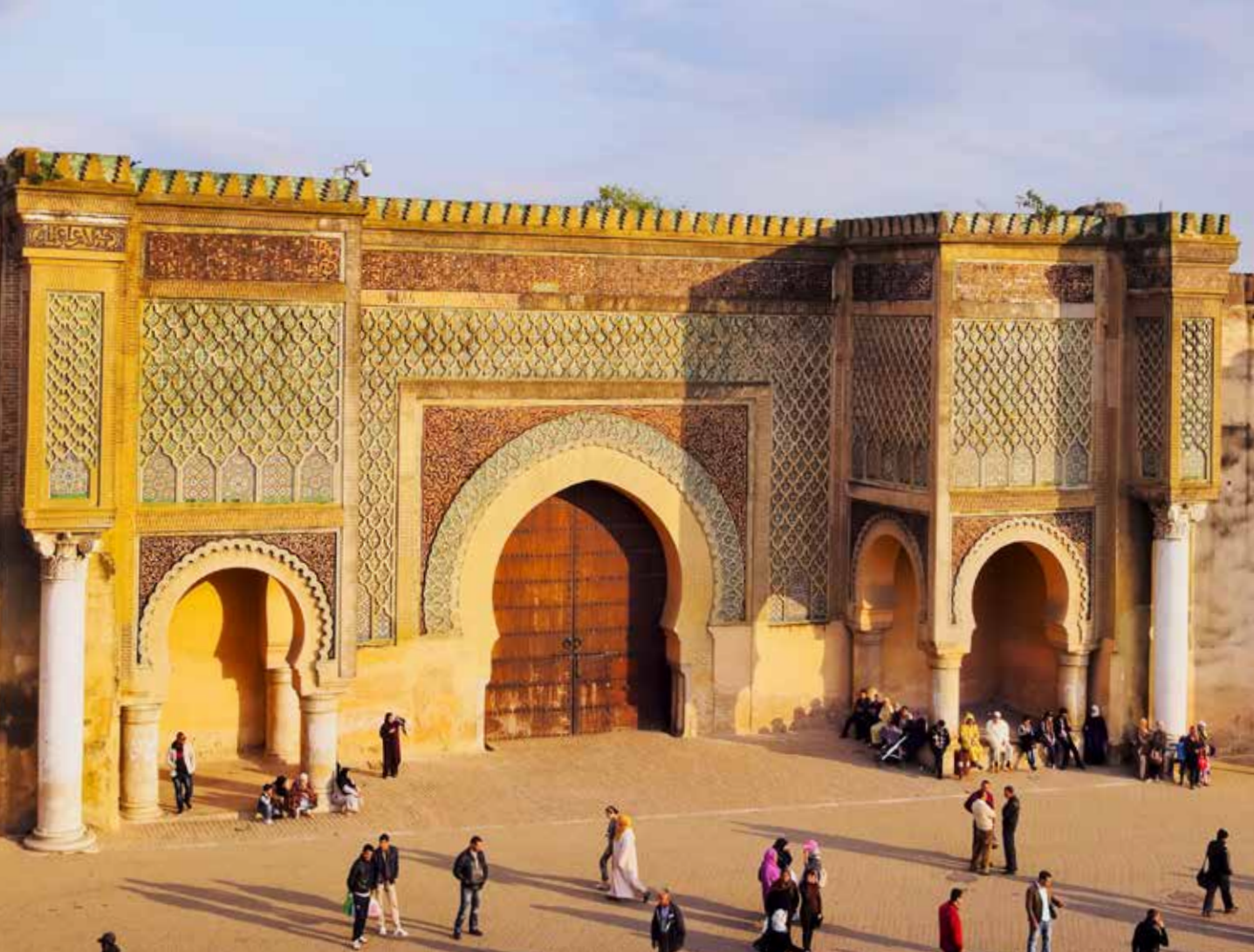
Bab Mansour Gate, Meknes

Explore Morocco through the lens of maternal health on this specially curated tour. From the bustling streets of Casablanca to the serenity of Bin El Ouidane , from the imperial grandeur of Meknes and Fes to the cultural heart of Marrakesh , this journey offers a unique opportunity to witness the country's diverse approaches to childbirth and women's healthcare, with its blend of tradition and modernity.