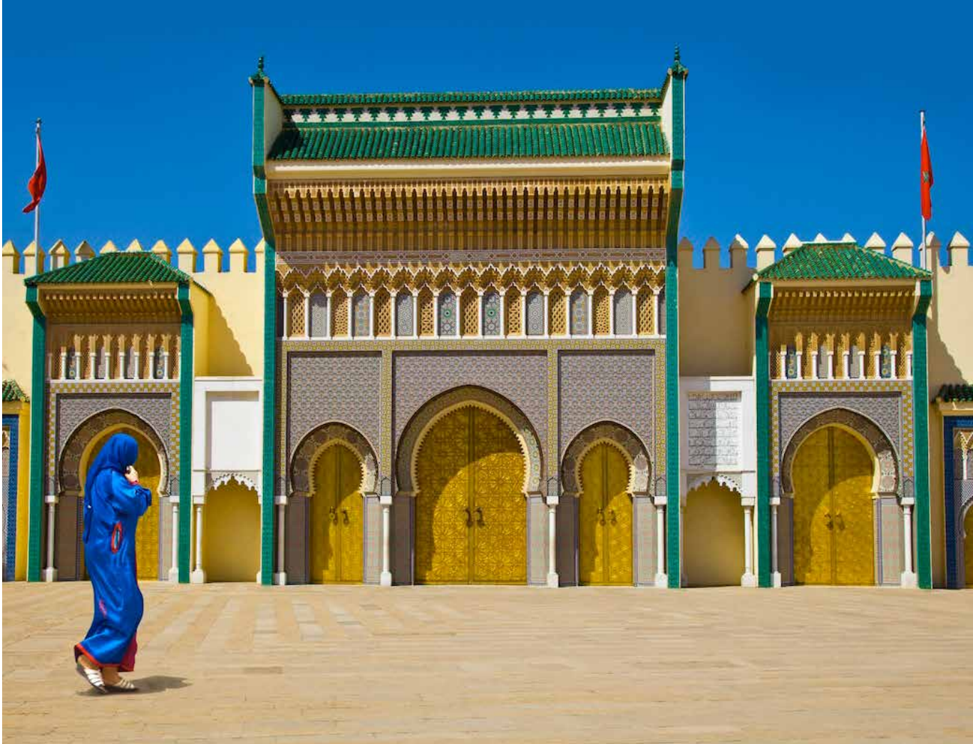
The Royal Palace, Fes