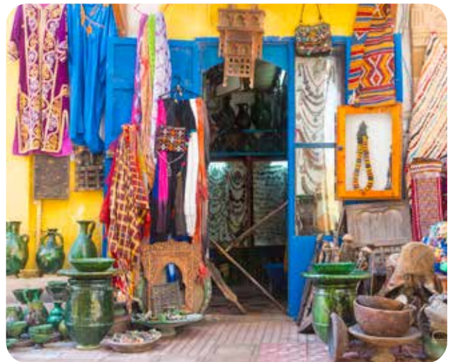
The old medina in Essaouira