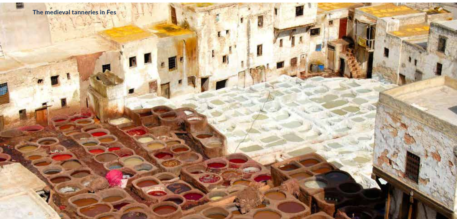
The medieval tanneries in Fes

Patti has travelled extensively and participated in several Jon Baines tours, including South Africa, Vietnam and Bali.