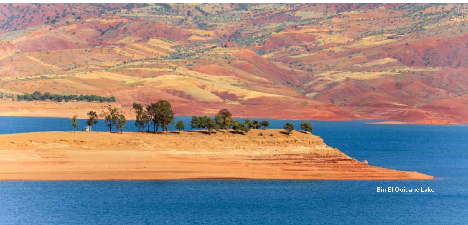
Bin El Ouidane Lake