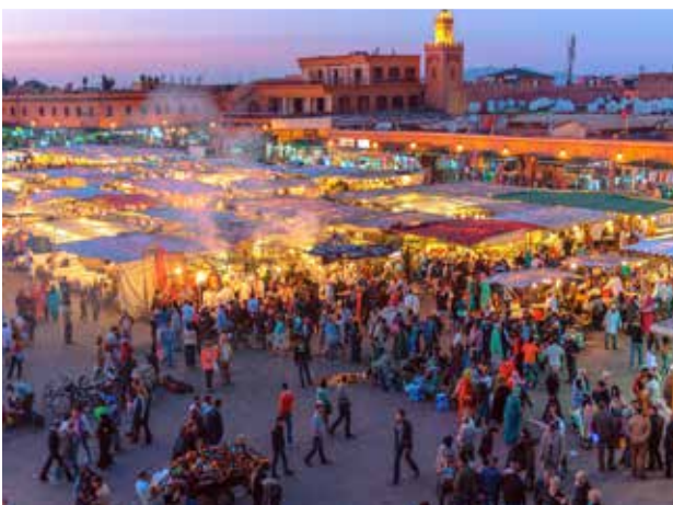
Majorelle Gardens, Marrakesh (top); The old walls of Rabat; Djemaa el-Fna, Marrakesh (above)

The cost of the tour sharing a room is USD $3,466 per person