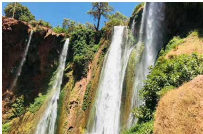
Hassan II Mosque, Casablanca (top); Making traditional argan oil; Musicians in the medina; Cascade Ouzoud (above)