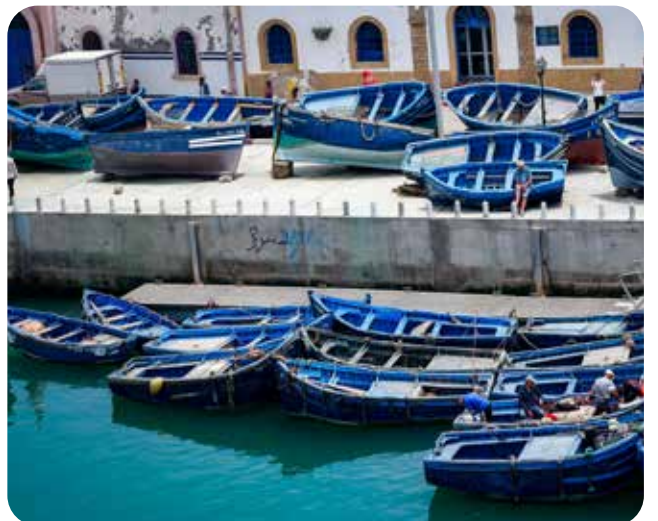
Blue fishing boats in Essaouira